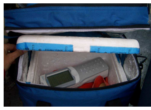
Figure 5. The i-STAT®1 analyser used for field analysis of arterial blood samples (left). Storage of the i-STAT®1 during fieldwork to ensure optimal temperature conditions (right).

All samples (whole blood) were processed immediately in the field using a portable analyser and cartridges (i-STAT®1 Portable Clinical Analyser and i-STAT® cartridges CG4+, 6+, CG8+, Abbott Laboratories, Abbott Park, Illinois, USA) (Fig. 5). Because the i-STAT®1 analyser only operates in +16 to +30°C, during hot days it was kept with freeze blocks in a polystyrene foam box in an insulated cooler bag. In cold climate, a warm water bottle in the polystyrene foam box prevented the analyser becoming too cold (Fig. 5).