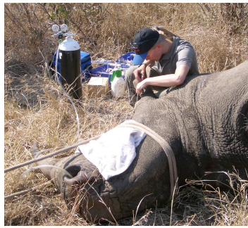
Figure 4. Intranasal oxygen supplementation to an adult female brown bear anaesthetised for radio-collaring in Sweden (left). Blood sampling from an auricular artery of an adult white rhinoceros receiving intranasal oxygen during immobilisation for translocation in South Africa (right).