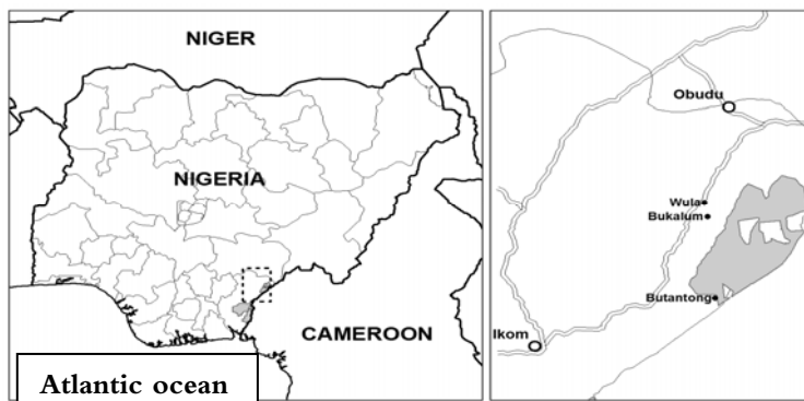
Figure 2. Location in south-eastern Nigeria (to the left) of Okwangwo Division of the Cross River National Park (shaded area to the right) and the villages in the survey (Bukalum, Butatong, and Wula).