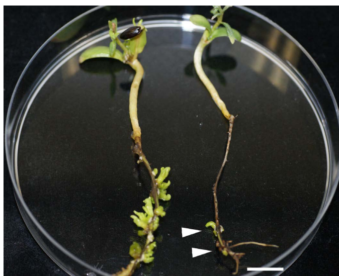
Figure 1. Several shoots forming from the root system of a Control seedling after 5 weeks in W4 medium (left), and a few adventitious shoots forming in a bombarded seedling after 7 weeks in selection medium (right). Bar is 1 cm.

A useful transformation procedure normally requires the regeneration of plantlets from transformed totipotent cells that are selected in vitro . In many reports, Seabuckthorn has been mentioned as being difficult to cultivate in tissue culture, e.g. [20]. Recently, however, we have developed rapid and efficient methods for production of adventitious shoots from the roots of both juvenile and adult plants of seabuckthorn [7]. By using various media, pre-treatments and different plant growth regulator combinations including the two synthetic cytokinins TDZ and CPPU, it was possible to discover interesting regeneration pathways for this plant. One of which was the induction of shoots from roots of young seedlings within a short period. In the present study, the initial induction stages of these adventitious shoots arising from root systems were chosen to be the target for transformation.