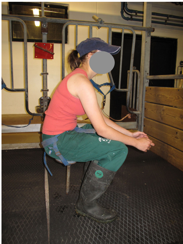
FIGURE 1 | Milking stool.

collected using the same validated and standardized questionnaire for assessment of MSSs, which made it possible to study trends in the prevalence of MSSs among Scanian dairy farmers. However, it was not possible to grade the severity or the type of MSSs, since the relevant questions in the questionnaire only asked if the respondents had at some time experienced MSSs, and did not enquire about the severity or the type of symptoms. For this, more in-depth studies are needed. Moreover, it was not possible to establish causality between MSSs and the risk factors studied, since the present study and the previous surveys were designed as cross-sectional studies where variables were measured at the same time. Therefore, we could not establish whether the MSSs or exposure to the risk factors came first.