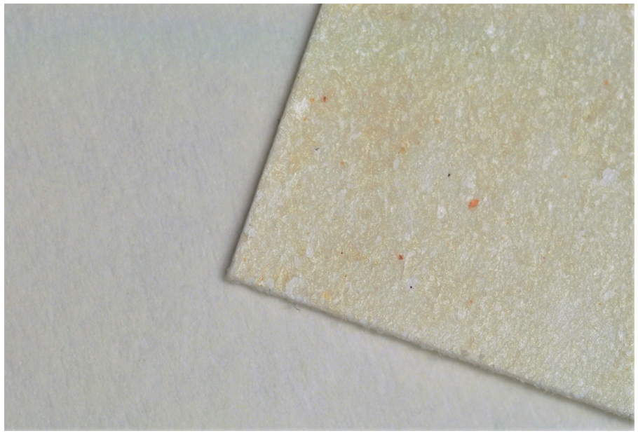
Wheat gluten coated paperboard has good oxygen barrier properties and grease resistance.

Food packages are important solutions for transporting and protecting the food so that it is easily and safely handled by retailers and consumers. The most common solution for such packages is paperboard based. Thus, paperboard products surround us in everyday life, although even these materials are not perfect. One problem is that paperboard readily allows gases to pass through it, making it unsuitable for many packaging applications. To combat this paperboards are often coated to improve the barrier properties and give them better aesthetics. Currently, most of these coatings depend on petroleum based plastics. For a more sustainable and circular use of natural resources, other solutions have to be searched for.