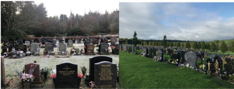
Figures 4–5. Examples of cemeteries in Ireland and Scotland. From left to right: photos from Birkhill cemetery in Dundee; St James’ cemetery in Cork.

As places of mourning, bereavement, and consolation, cemeteries and crematoria gardens accommodate personal as well as social and environmental functions (Jedan et al., 2019). The meaning of the individual/private grave, and how it is shaped and decorated, is of importance for mourning and remembrance (Pettersson & Wingren, 2011). Further, interactions with ‘deathscapes’ are not just experienced through the materiality of physical spaces, but also and at the same time through embodied-psychological experience and various forms of virtual space, including both digital spaces and arenas of belief and belonging, such as idea of ‘heaven’ (Maddrell, 2016). This embodied experience of loss, mourning, and consolation is also frequently reflected in a sense of a continuing bond with, and/or responsibility to, the dead (Klass et al., 1996; Klass & Steffen, 2018). This highlights the complexity of emotional-affective environments, particularly those connected to the disposition of the dead, mourning, and remembrance, and how this is culturally inflected. This in turn demonstrates the social and cultural significance of cemeteries and crematoria gardens, and the importance of their organisation and management, including their diversity-readiness .