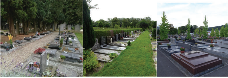
Figures 6–8. Examples of cemeteries in The Netherlands and Luxembourg. From left to right: photos from Tongerseweg municipal cemetery in Maastricht; municipal cemetery Noorderbegraafplaats in Leeuwarden; Notre Dame in Luxembourg-City.