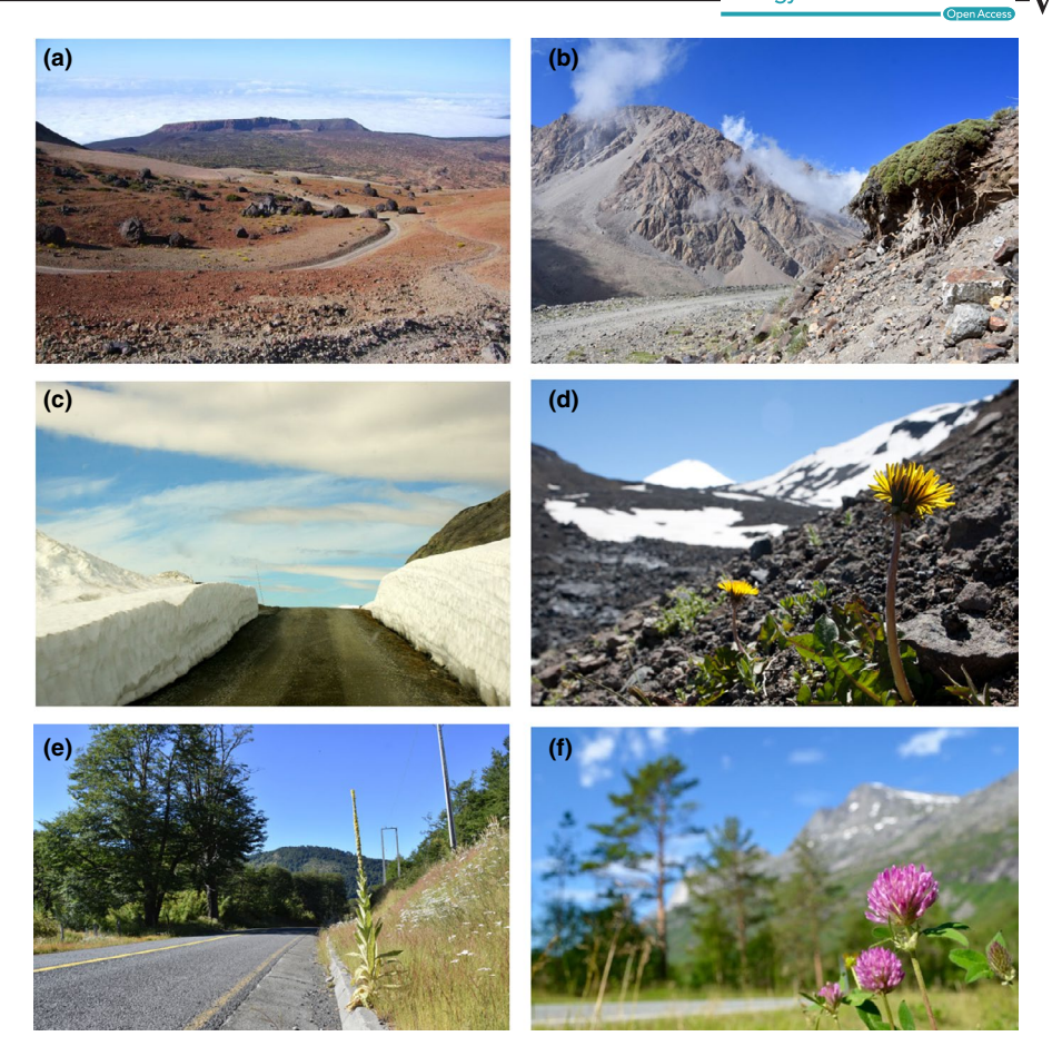
FIGURE 1 Examples of roads in the landscape (a-c) and key non-native species (d-f) across a range of MIREN regions. (a) Harsh mountain climates (here the Cañadas del Teide on Tenerife (Canary Islands, Spain) have traditionally been seen as an adequate barrier against non-native plant invasion; (b) the direct local impact of roadside disturbance on mountain plants is visible on native Azorella cushion plants along a road in the dry Andes near Mendoza, Argentina; (c) interactive effects of climate and land use, exemplified by dramatic differences in snow cover on versus beside a mountain road in northern Norway; (d) Taraxacum officinale, one of the most widespread non-native plant species along MIREN mountain roads (Seipel et al., 2012), in a sample plot on a volcanic gravel slope in the Argentine Andes; (e) non-native Verbascum thapsus on a roadside in the highly invaded lowlands of the Andes in central Chile; (f) Trifolium pratense in northern Norway, where the species is rapidly moving uphill along mountain roadsides

per road located at the splits between elevational bands. Sample sites are determined prior to going into the field and located as precisely as possible using a global positioning system (GPS). At each sample site, three 2 m \times 50 m plots are laid out in the form of a "T": one plot (the top of the "T") is parallel to the road. The other two plots extend end-to-end and perpendicular to the road, starting from the center of the first plot, with midpoints at 25 and 75 m from the roadside plot (Figure 3). The same plots are resurveyed every five years. If the plot locations have to be changed due to unforeseen circumstances, new sites are placed as near as possible and again geolocated.