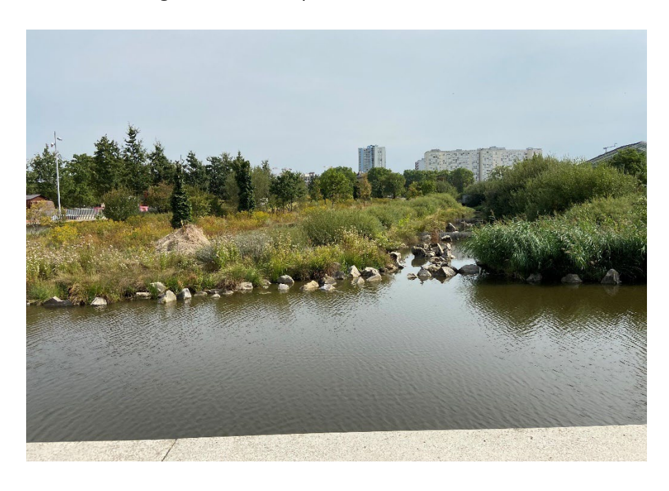
Figure 4. View of Grand Parc des Docks de Saint Ouen and parts of the surrounding building blocks.