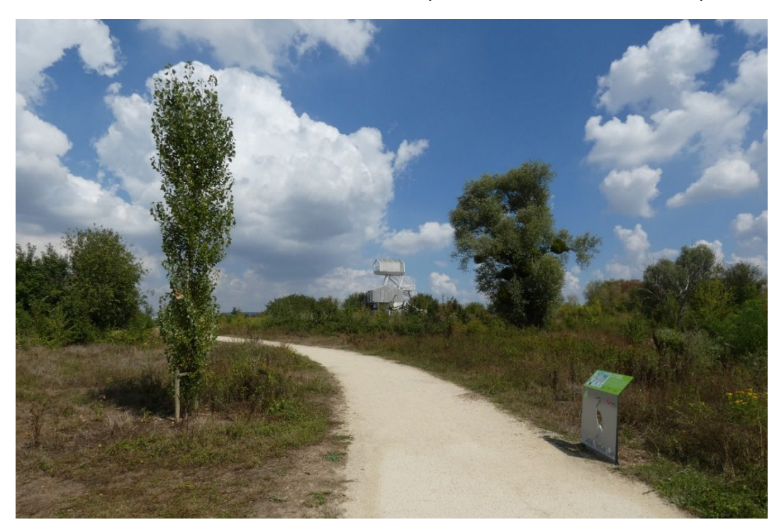
Figure 12. Parc du peuple de l'herbe.

preservation of biodiversity and the landscape, linking nature and the city, restoration of abandoned spaces