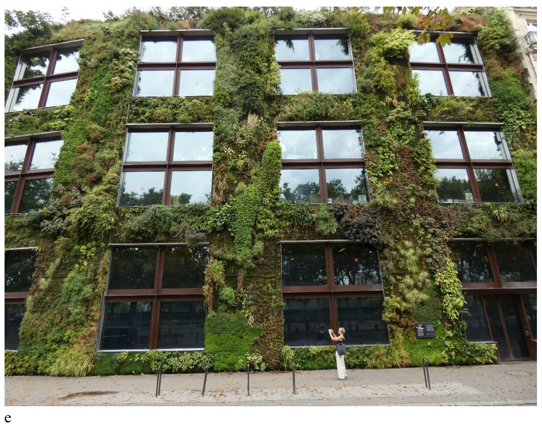
Figure 15. Green wall, Quai Branly.