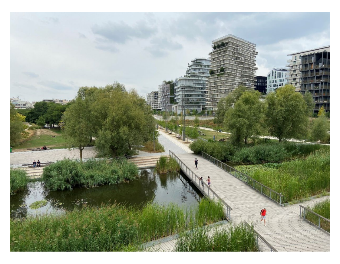
Figure 6. Parc Clichy-Batignolles – Martin-Luther-King.