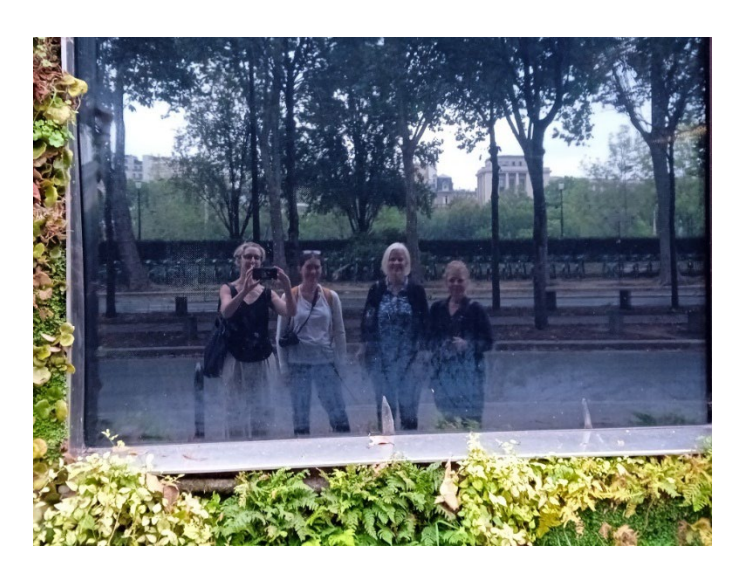
Figure 1. The team visiting the vegetative wall at Musée du Quai Branly.