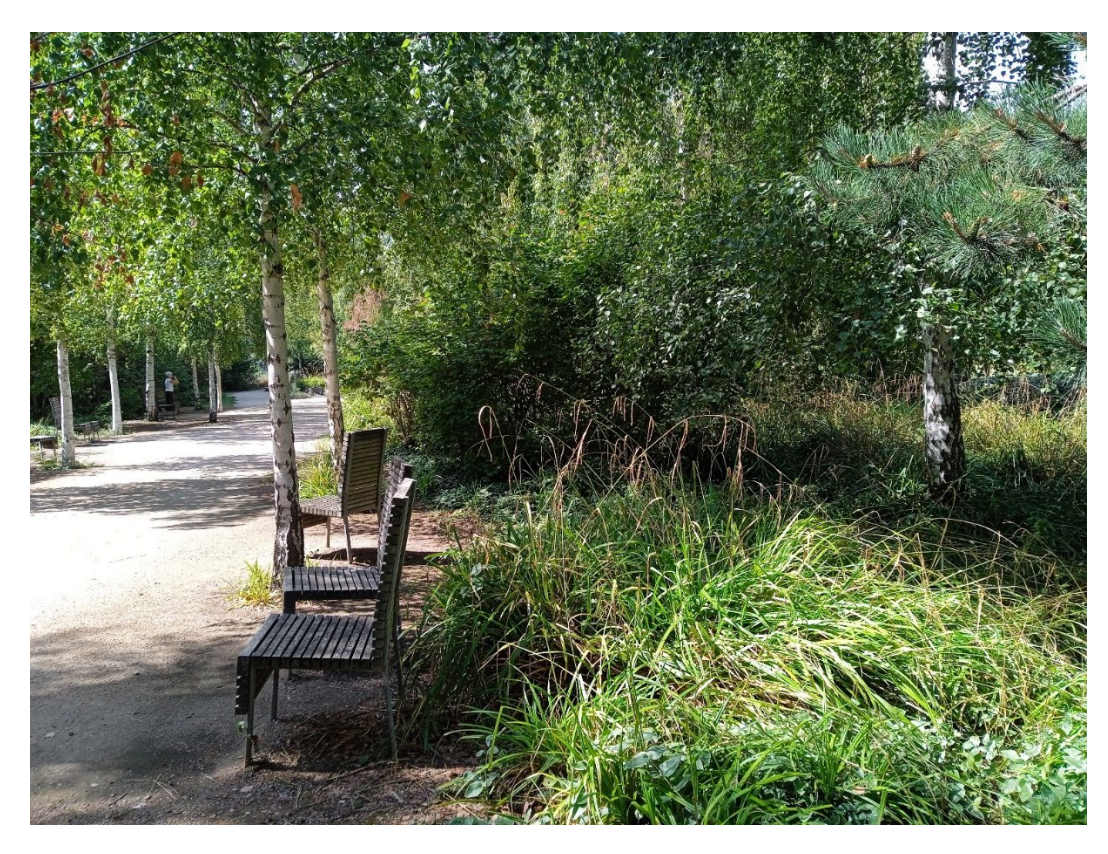
Figure 10. Parc de Billancourt.