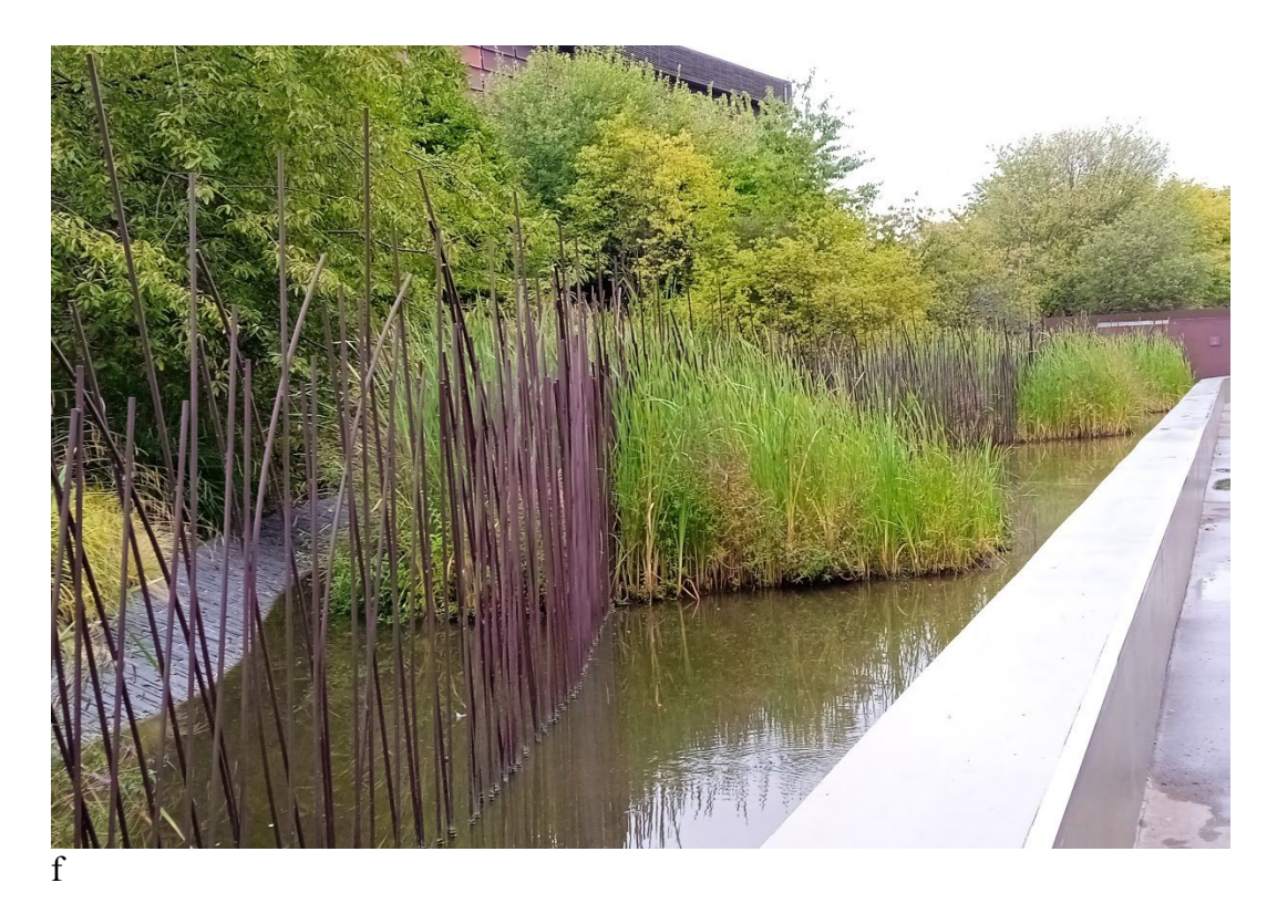
Figure 9. Jardin au Musée du Quai Branly.