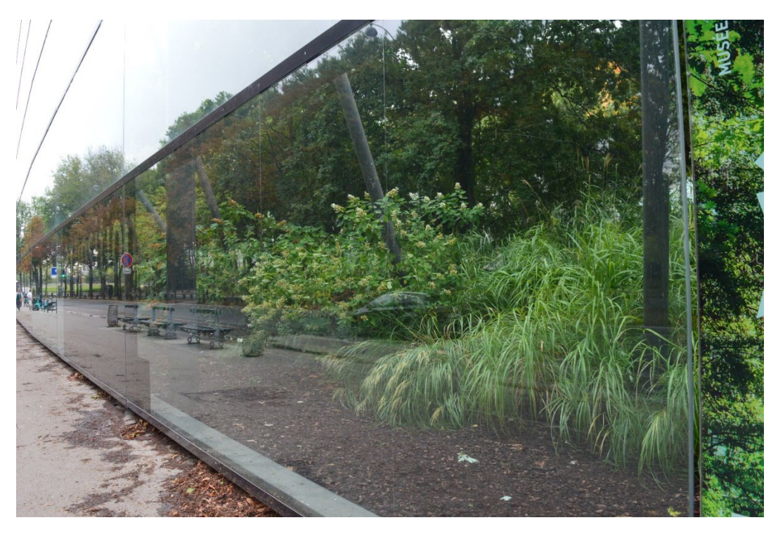
Figure 8. Jardin au Musée du Quai Branly.