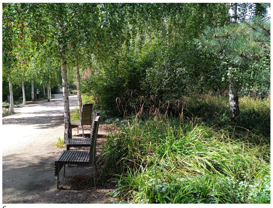
Figure 11. Parc de Billancourt.