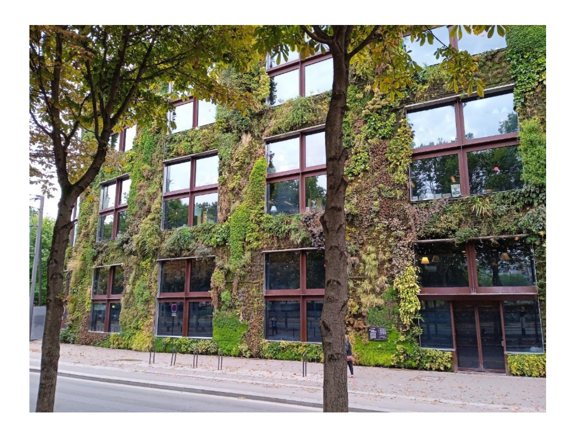
Figure 14. Green wall Quai Branly.

in French. The theme is to allow both plants and buildings to live in harmony with one another.