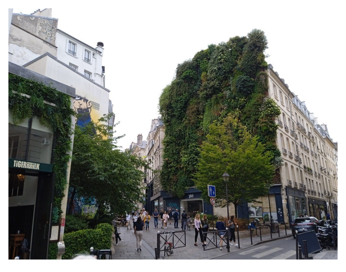
Figure 16. Green wall, L' Oasis d'Aboukir.