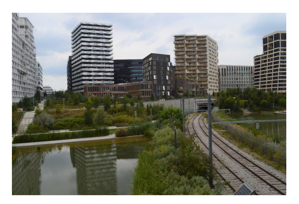
Figure 3. Parc de Clichy-Batignolles – Martin Luther King.