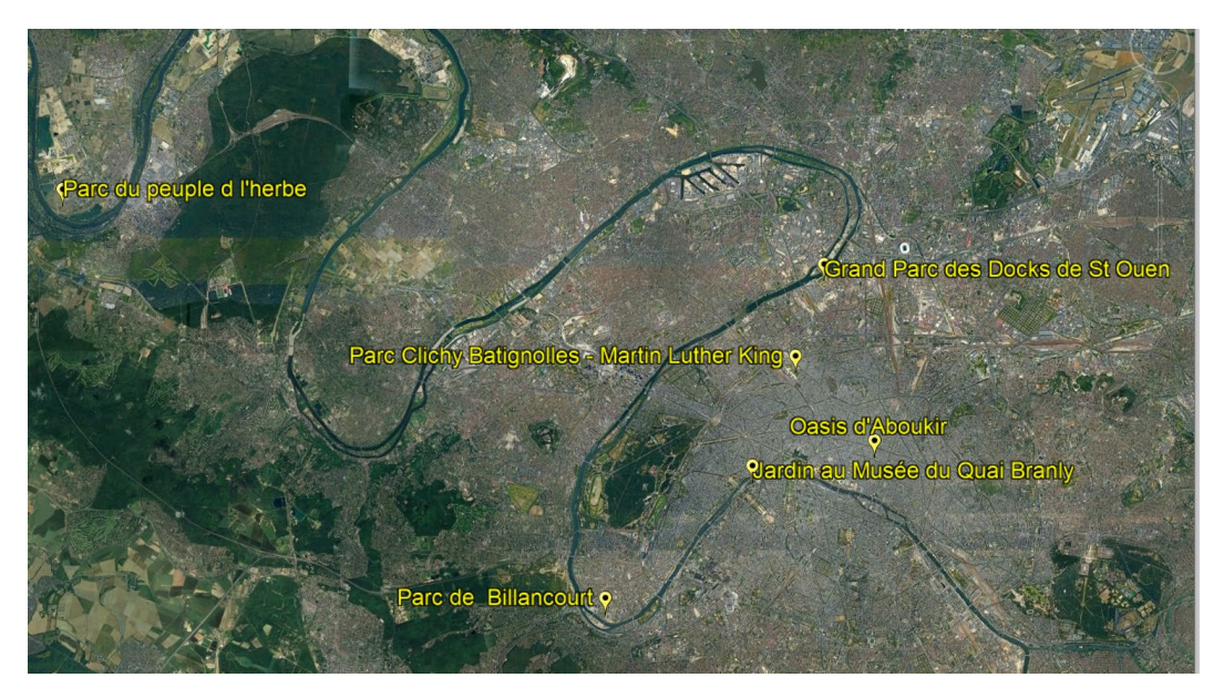
Figure 2. Location of the studied parks and green walls in Paris (Google Earth).