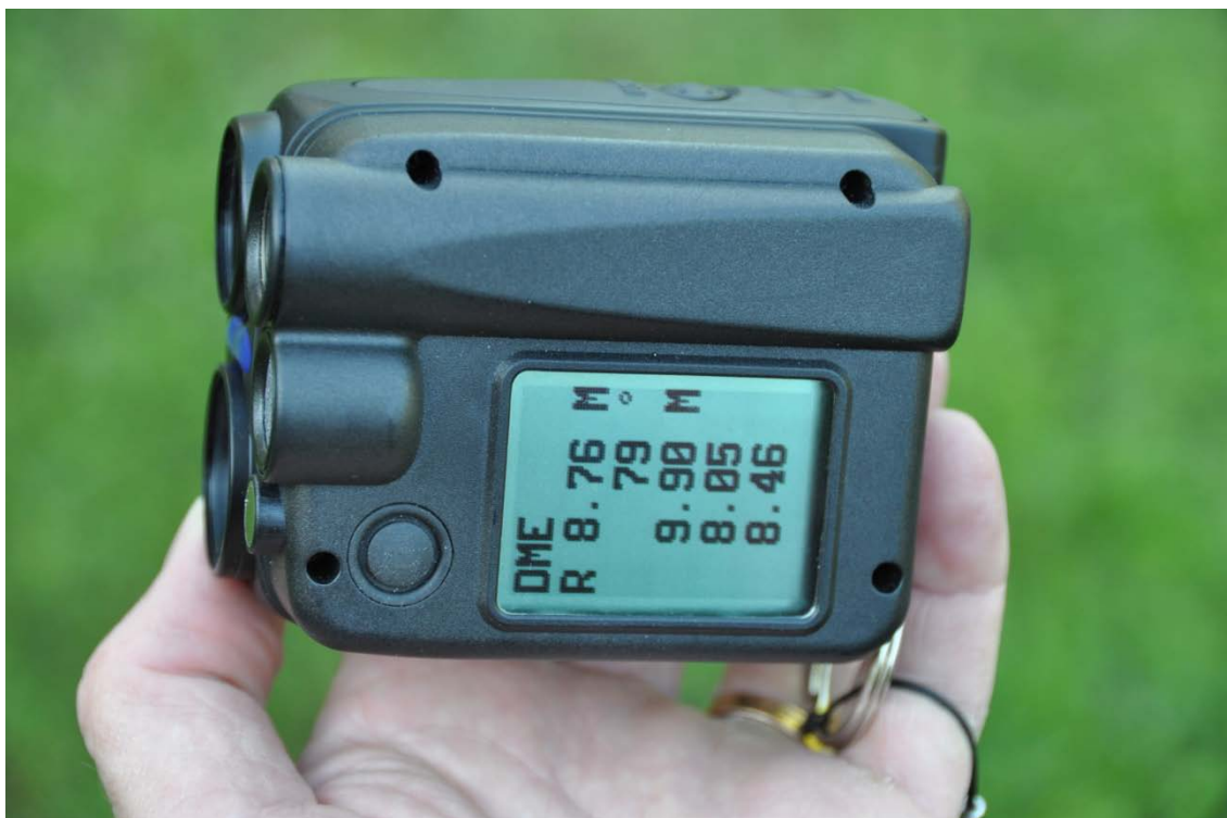
Figure 3. The handheld part of the PosTex instrument, consisting of a modified version of the Haglöf Vertex Laser inclinometer and rangefinder. The display shows the calculated position in the local coordinate system – distance from plot centre (m) and angle ( ^{\circ} ) – and the three measured distances to the transponders (m).

PosTex is manufactured and marketed by Haglöf Sweden AB ( www.haglofsweden.com ). In its present version the handheld part is based on a modified version of the Haglöf Vertex Laser (Fig. 3). This is an electronic inclinometer, including a laser rangefinder, ultrasound distance measurer, and electronic vertical angle gauge. In the PosTex version it provides distance (e.g., as part of tree height measurement), height, slope, and position measurements. When taking positions on (considerably) sloping ground a two-step procedure is used. First, the slope from the tree to the plot centre is measured and when the subsequent position is taken the position in the horizontal plane is registered. Data from the instrument can be transmitted to a processing system, e.g. a field computer, via Blue Tooth.