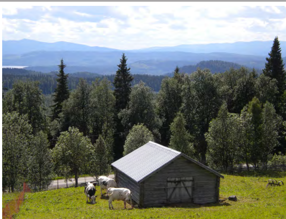
Figure 3 Animal houses. Cow houses on a summer farm, which provide shelter for animals from mosquitoes and other insects as well as from predators. Summer farms are often subject to cultural heritage preservation rules and thus have to balance the competing interests of preservation and functionality, as well as regulations within e.g. animal health. This picture was taken in Valsjöbyn, Jämtland County, in July 2010.

Small-scale dairy farmers take an ambivalent view of the fact that they have to get up every morning to milk their cows and often direct all their attention to problems as they emerge. On summer farms, the working conditions are also problematic - the animal houses are often small and lack electricity (Figure 3), while the buildings constructed for cheese production are often small and laborious to work in (Figure 4). While this is seen as a problem and a burden, it is also often talked of in positive ways. Most farmers realise that if they shifted from milk to meat consumption they would not only reduce their work burden substantially but also improve their profitability, as current European Union Common Agricultural Policy (CAP) subsidies prioritise keeping the landscape open through grazing, while subsidies for milk production are less advantageous to farmers. However, there are farmers who would rather stop farming altogether than sell their milk cows. The reason for this attitude is presumably the special bond that exists between farmers and their animals. When the practices of forest grazing on summer farms are examined more closely, it is easy to see the