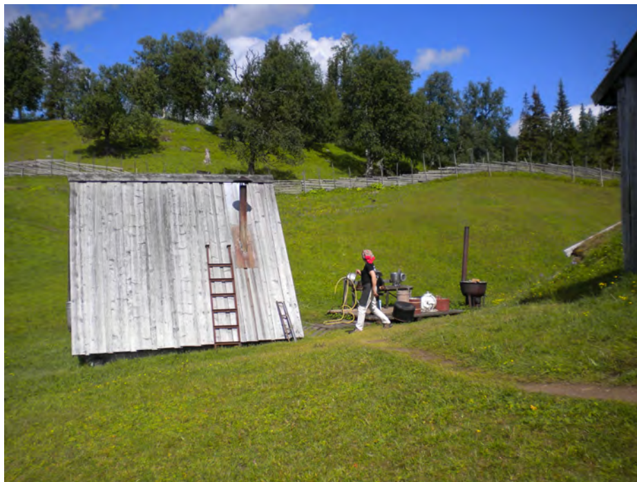
Figure 4 Cheese-making shed. Small sheds ( kokhus ) are usually built for producing cheese from milk and the distinct Scandinavian whey cheese ( mesost ) and whey butter ( messmör ), which needs to boil one full day in order to caramelize and thicken. This picture was taken in Valsjöbyn, Jämtland County, in July 2010.

intrinsic ways in which animal behaviour and bonds with animals are crucial to the operation (Figures 3 and 4).