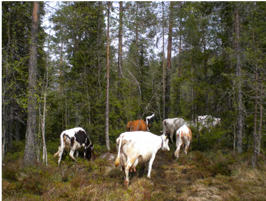
Figure 5 Traditional cattle breeds. This picture shows mountain cattle ( fjällko ), and red cattle ( rödskulla ) pasturing in the forest outside Rättvik, Dalarna County, in June 2010. Farmers claim that traditional breeds are better adapted to forest pasturing, as they are lighter and better suited for feeding on the buds, herbs and thick grasses that grow in forests and mires.

through violent fights, which I witnessed myself while participating in moving cows from a farm to a summer farm in the beginning of the grazing season ( buföring ), a walk of around 35 km in this particular case (Figure 5).