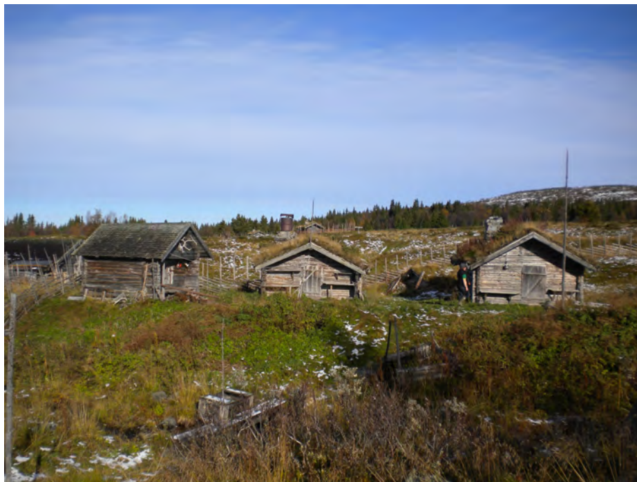
Figure 1 Summer farm (fäbod). Summer farms accommodate both people and animals but are simple and usually lack electricity and running water due to their location in marginal forested areas. However, this lack of facilities is often appreciated today, as it preserves farming practices and gives the summer farm a genuine feeling. It also has some practical advantages, such as being low-maintenance during the harsh Swedish winter. This picture was taken in Arådalen, Jämtland County, in September 2010.

Considering that the total population of Norway is only around five million people compared with Sweden's nine million, it is remarkable that Norway has more than five times as many summer farms in use. There could of course be a number of reasons behind this difference in numbers, but it can be taken as an indication that politics and agricultural policies matter. In the remainder of this paper, Swedish fäbodbrukare , smallholders keeping summer farms, are referred to as 'farmers' for simplicity and ease of comprehension.