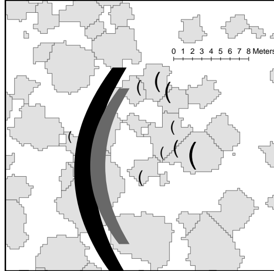
Figure 2. Example of polygons from segmentation of ALS data and field-measured trees shown as circles with radius proportional to DBH. The outer large circle represents the field plot and the inner large circle represents the area where the centres of the reference segments are located.

Segments close to a field plot boundary usually cover ground outside the field plot and it is not known how many trees they contain. The models for individual trees were therefore based only on segments where the centre was located inside a field plot and at least 2 m from the boundary, from now on referred to as reference segments (figure 2). The estimation of variables at the individual tree level did, however, include all segments where the centre was located inside a field plot. We excluded trees with a large inclination from the field data when estimating the models at the individual tree level, but included them when estimating the models at the field plot level and validating the estimated results.