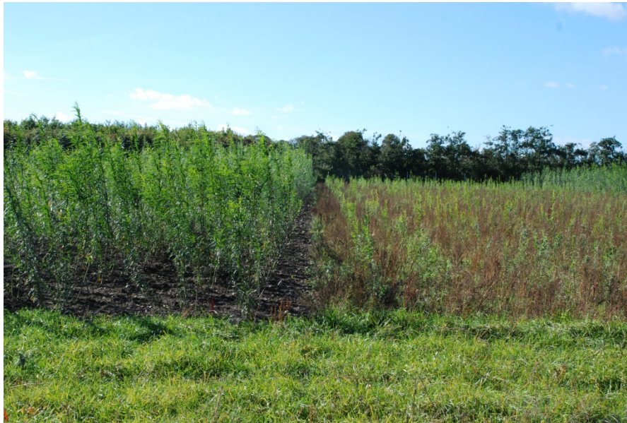
Figure 3. (Left) Willow plots thoroughly weeded and (right) unweeded plots. Photo taken five months after planting at the site S (which had least mean growth reduction).

The willow biomass was negatively correlated with the amount of weeds during the first season at all three sites (Paper I). Similarly, Sage (1999) found a negative correlation between willow growth and weed biomass, in that case with one-year-old shoots on two-year-old willow stools.