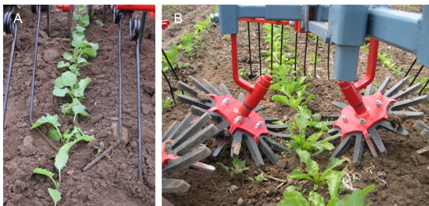
Figure 2. A) Torsion weeder and B) finger weeder.