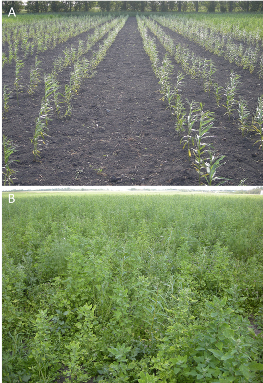
Figure 1. Images of a willow plantation 10 weeks after planting (site P). A) Plots with weeds removed mechanically and by repeated hand hoeing and B) plots with no weed control.