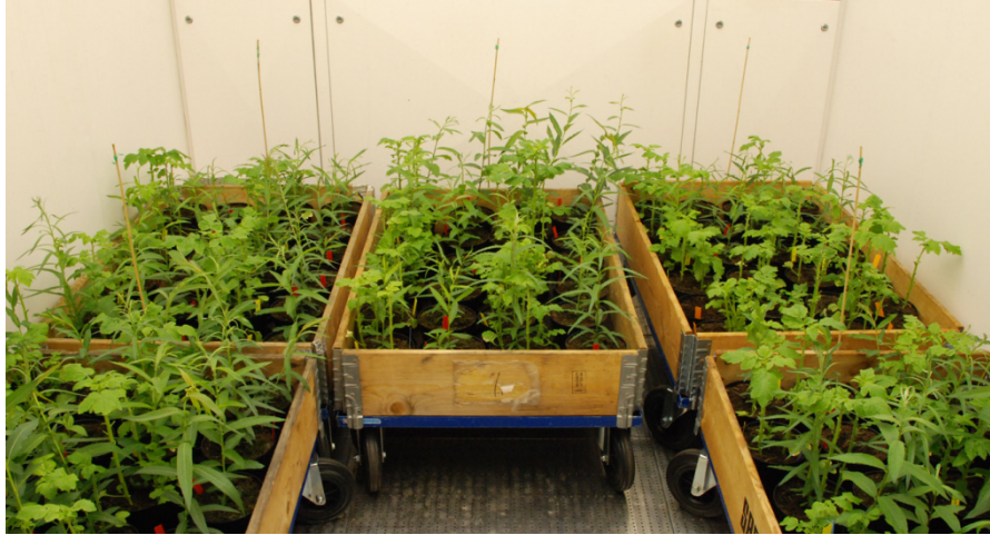
Figure 4. Willow clones with a wide genetic background cultivated together with an herb in an indoor weed competition study (unpublished data).

treatment than in the weeded treatment at site S when only the incremental growth during the third season was considered. However, the low growth reduction of these two clones can be partly explained by the fact that neither was among the best in terms of willow shoot biomass production when grown without weeds.