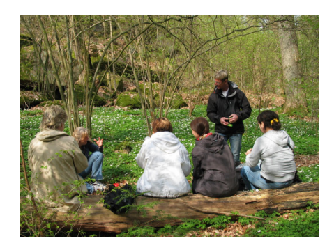
Figure 2. Education about nature during a guided nature walk.

Figure 1. Garden activity.