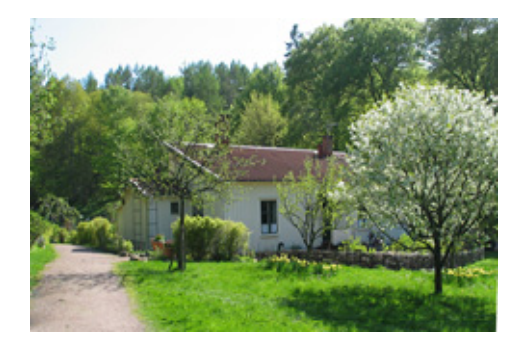
Figure 3. The house with the nature reserve in the background (Photo Eva Lena Larsson).

Measures were collected at baseline (at the end of the first of 24 course sessions) and at the last session (3 months after course start), and 6 and 12 months after the last session follow-up questionnaires were sent by mail to those who had agreed to participate in the study (See Figure 5).