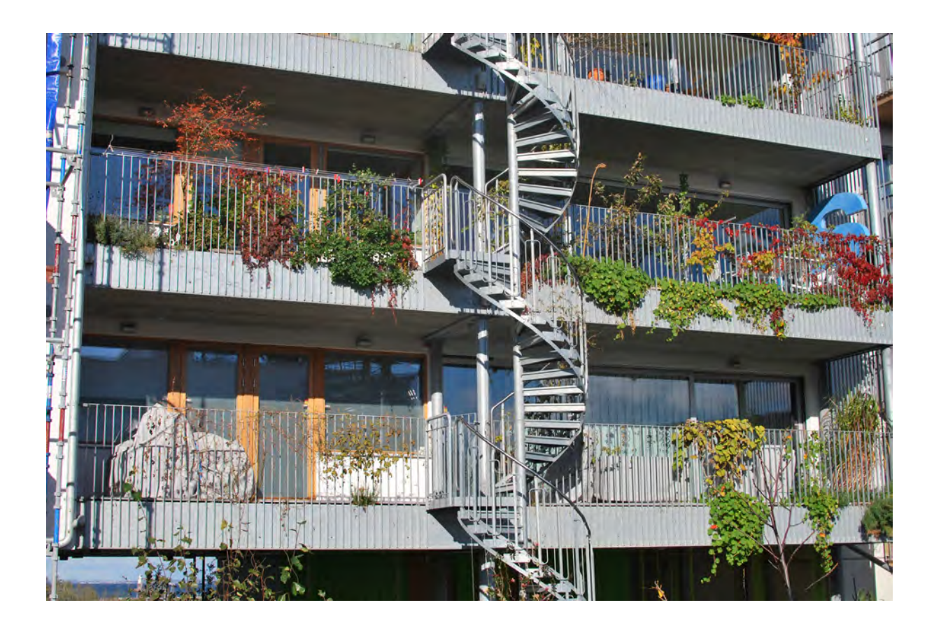
Figure 4 Urban Villas in Western Harbour, Malmö

From outside the unit, the most striking feature was probably the green balconies. These were constructed as wide pots with soil covered by slabs which can be replaced with plants. Each balcony was connected to an apartment.