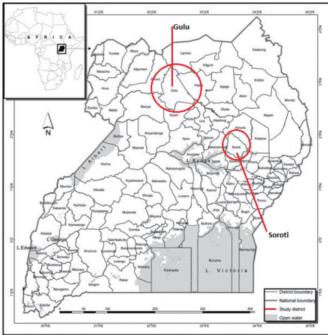
Fig. 1. Map of Uganda showing the location of Gulu and Soroti Districts.