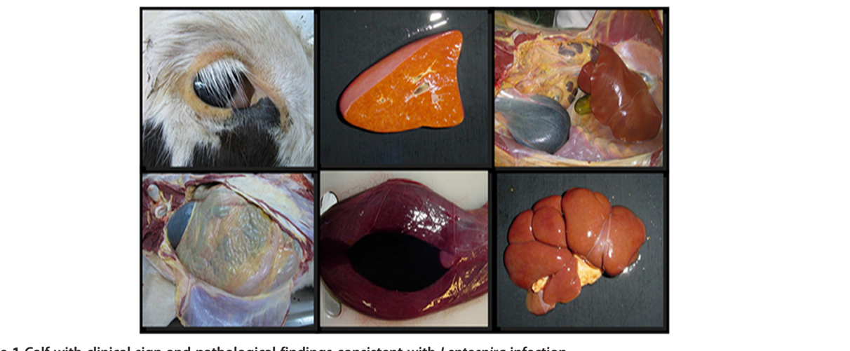
Figure 1 Calf with clinical sign and pathological findings consistent with Leptospira infection.

To refine our understanding of the Leptospira specie and serovar associated with this clinical case, a Variable Number Tandem Repeat (VNTR) analysis was done. The VNTR primers were designed exclusively for use with L. interrogans [10-12]. PCR products for VNTR loci 4, 7, 10, 23, 27, 29, 30, 31, and 36 were assessed using the same PCR reaction as described above and the primers used were as previously reported [12]. PCR products were