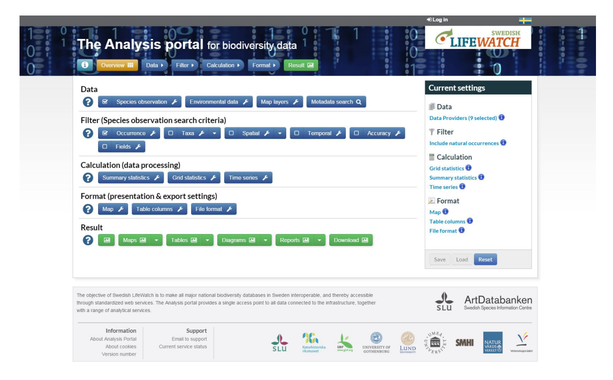
Figure 2. The Swedish LifeWatch (SLW) Analysis portal (https://www.analysisportal.se).

The Analysis portal allows the user to select one or several taxa in any combination. Taxa can be selected by entering the name or be selected based on their classified traits, such as life history, habitat preferences and pressuring factors, according to a traits database maintained at the Swedish Species Information Centre. Taxa can also be selected by drawing a polygon on a map querying all databases about what taxa have been registered within them, or by asking what taxa from a certain time period or a certain habitat are represented in them, or any combination of such variables.