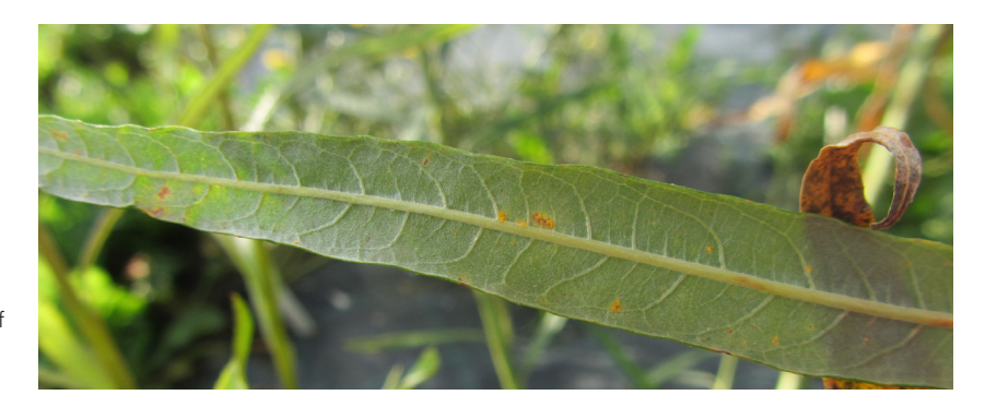
Figure 1. Photograph of a Salix viminalis leaf infected by Melampsora spp.