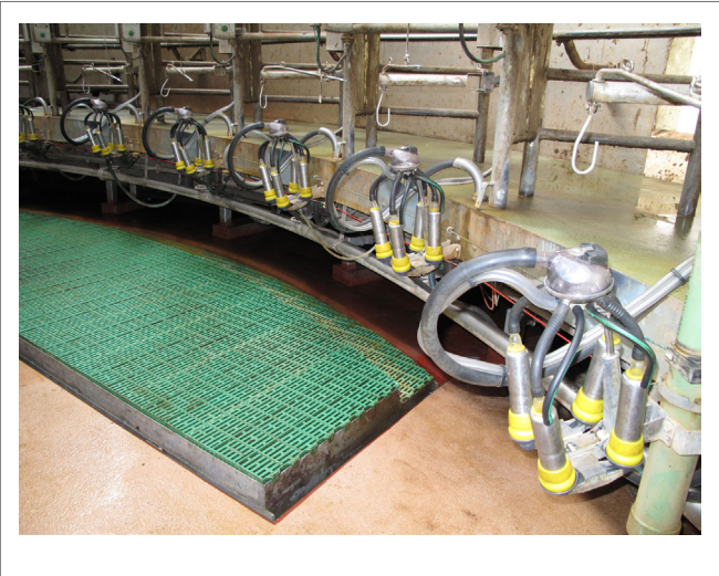
FIGURE 5 | Adjustable floor.

with milking robot systems in 2013 reported fewer MSSs overall, especially in shoulders (men) and lower back (women), compared with those working with other systems. An explanation for this is of course that the robot, instead of the milker, performs most of the heavy, repetitive, and one-sided milking tasks. A reduction in the risk of musculoskeletal problems with robotic milking compared with conventional milking has also been reported in other studies (34). Just over 28% of the Scanian dairy farmers surveyed in 2013 responded that they worked with robotic milking systems. This corresponds fairly well with the incidence of robotic milking (32%) throughout the country (35).