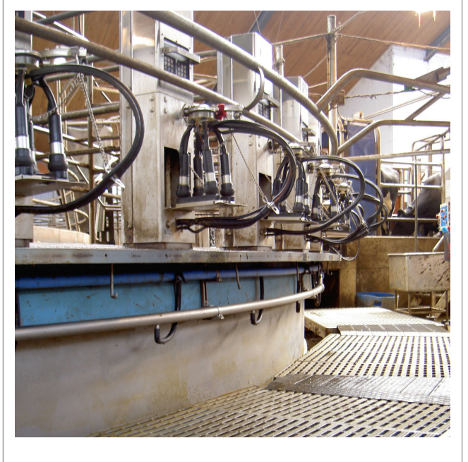
\label{eq:FIGURE 4 | Automatic cluster removal. @Christina Lunner Kolstrup, Stefan Pinzke.