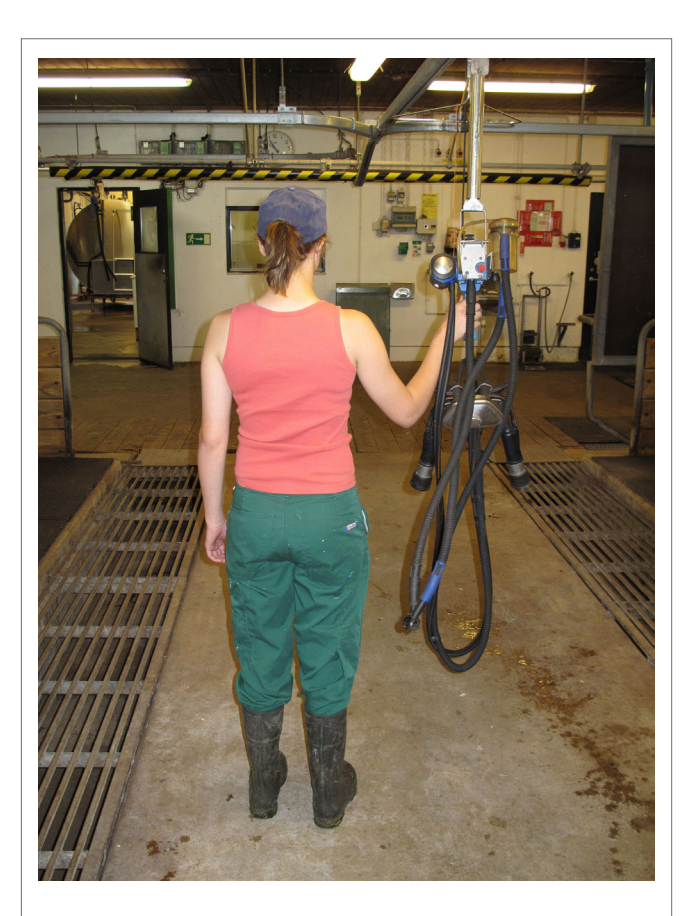
FIGURE 3 | Milking rail.

which are risk factors for MSSs in the shoulders and lower part of the body. On the other hand, milking in loose-housing systems involves repetitive and monotonous work, which is a risk factor for developing MSSs, especially in the upper extremities (5, 8–10, 14-20). As this study shows, milkers still reported an equally high frequency of MSSs as in the past, regardless of whether they worked in tethered or parlor systems. However, those working