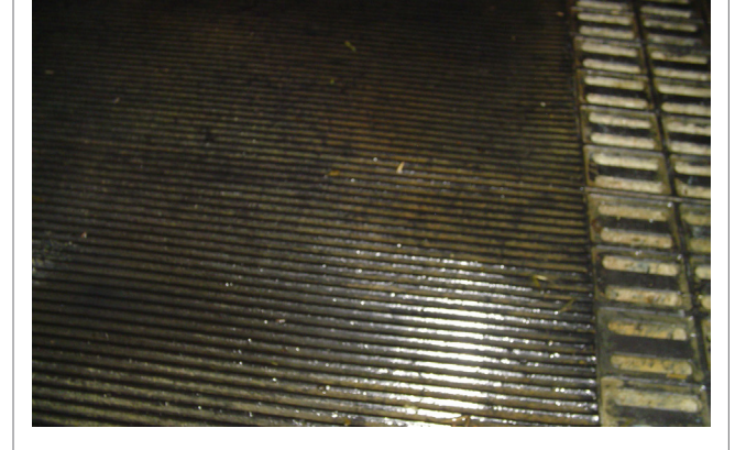
FIGURE 2 | Rubber matting.

Several studies have shown that compared with milking in parlor systems, milking in tethered stall systems involves more loading work postures and more handling of manual materials,