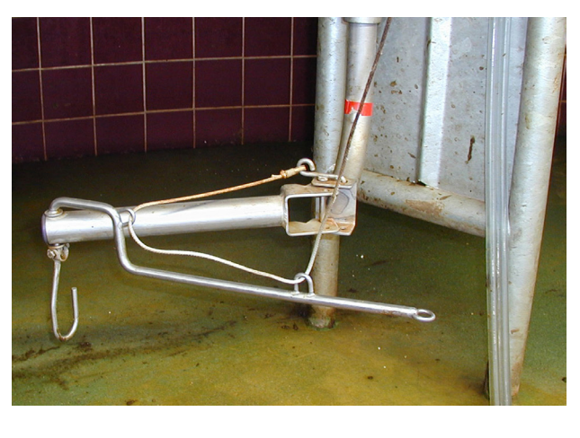
FIGURE 6 | Support arm.

with milking robot systems in 2013 reported fewer MSSs overall, especially in shoulders (men) and lower back (women), compared with those working with other systems. An explanation for this is of course that the robot, instead of the milker, performs most of the heavy, repetitive, and one-sided milking tasks. A reduction in the risk of musculoskeletal problems with robotic milking compared with conventional milking has also been reported in other studies (34). Just over 28% of the Scanian dairy farmers surveyed in 2013 responded that they worked with robotic milking systems. This corresponds fairly well with the incidence of robotic milking (32%) throughout the country (35).