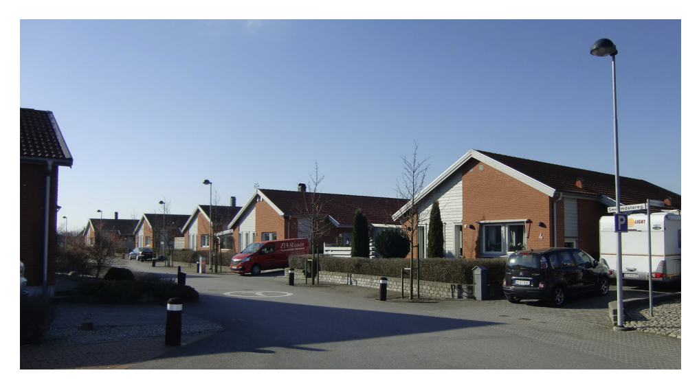
Fig. 4. Tegelbruket, a residential area from the 2000s in southern Svedala, dominated by relatively small houses with small gardens.

they plan to spend the entire summer in their second home. Before moving to the new apartment they stayed in their second home for two and a half months. However, with the novelty of the new apartment there have been fewer visits lately. The lake as such is an important amenity: they have a small boat and "love to go fishing". When asked what the second home can offer in comparison to the apartment, she said: