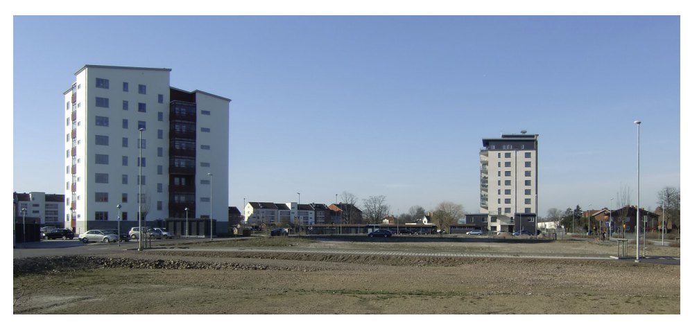
Fig. 3. Segestrand, a new residential district (developed on a former industrial site) within walking district of Svedala train station. The two high-rise blocks were completed in 2014.

A: "... to be honest we didn't use it [Torup and Bokskogen recreation area] much, we really didn't, since we have a cottage as well down by Lake Ringsjön. No, well, I suppose we have gone for a walk in Torup, [but] I love to sit indoors and enjoy the view."