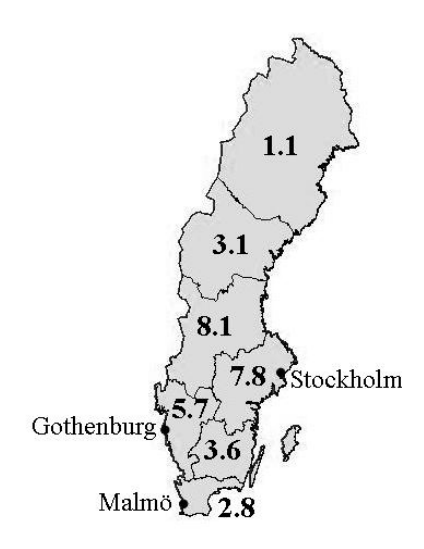
Figure 2. The location of the organic dairy farms in proportion of all dairy farms in different regions of Sweden.

The number of organic farms in percentage of all dairy farms in the different regions also showed a high proportion of organic farms in the area around the two largest cities, Stockholm and Gothenburg (Figure 2). However, around Malmö (Sweden's third city in population size) in the south, the proportion of organic farms was low (not published).