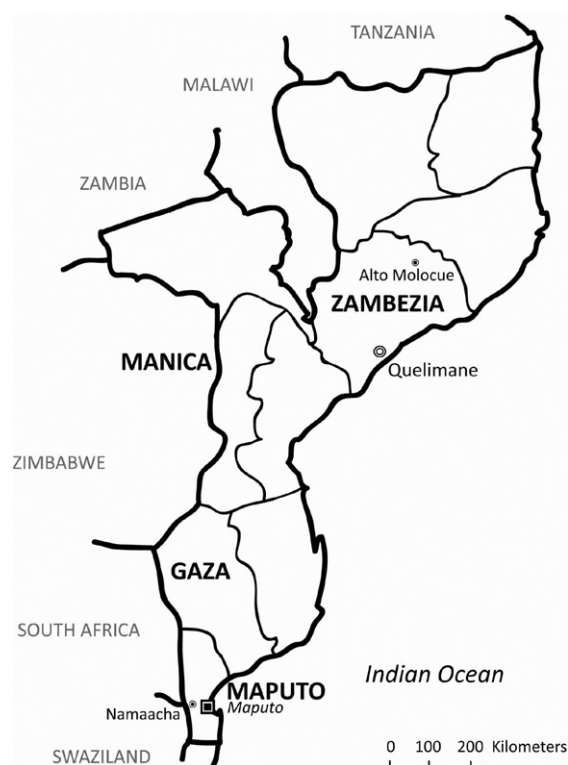
Fig. 1. Map of Mozambique and neighboring countries. The map shows the capital city of Maputo (italics) and the provinces referred to in the article (bold capital letters), as well as the city of Quelimane and the approximate locations of the Namaacha and Alto Molocue Districts.

The experimental procedures using animals were approved by the Mozambican Board of Agriculture (ethical permission no. 555/DNSV/2008, Maputo). Thirty mixed breed cattle were raised in a free-range feeding system in the Namaacha District, Maputo Province (Fig. 1), with the main diet based on grass and hay to which mineral salts and food supplements were added during the dry season (March–August). These animals were divided into three groups (designated A, B, and C) initially with 10 animals in each. An additional 41 head of mixed-breed cattle (designated group D) were raised in the Alto Molocue District, Zambezia Province (Fig. 1), under conditions similar to those described for groups A–C, but without food supplements during the dry season. Two more animals were kept as negative controls in the Namaacha District, Maputo Province. None of the cattle had previously been vaccinated against RVFV. Characteristics of the animals are given in Table 1.