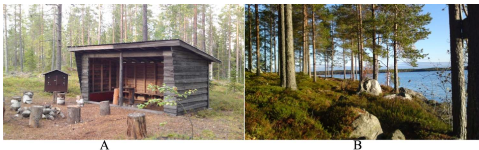
Fig. 1. A: the ‘basecamp’ used for eating, breathing exercises and gathering at the end of each visit in the forest environment. B: view from the forest towards lake Bäcksjön.

The forest environment was located in the boreal zone (Ahti et al., 1968) near lake Bäcksjön (coordinate system WGS 84: 63°58' N, 20°21' E) about 17 km from the city of Umeå in northern Sweden. The lake is approximately 3 km long, 1 km wide and surrounded by various types of forest and natural features with no settlements. The site where the participants spent most of their time was in boreal forest, managed according to standard practices in the area, dominated by pine ( Pinus sylvestris ), spruce ( Picea abies ) and scattered broadleaves, mostly birch ( Betula pubescens ). Light was measured at each visit with a Model 1300 light meter (Clas Ohlson, Sweden). The mean light intensity in the forest during the two intervention periods were 2780 lx (stand. dev. 3422 lx) in the autumn and 13734 lx (stand. dev. 8222 lx) in the spring. A “base camp” was established by a windshield with a hearth surrounded by big birch stumps that were used as seats during the meals and the breathing exercises (Fig. 1). The participants were given warm clothes, rubber boots, rain gear and a sleeping mat so they could be comfortable regardless of the weather and sit down on the ground to