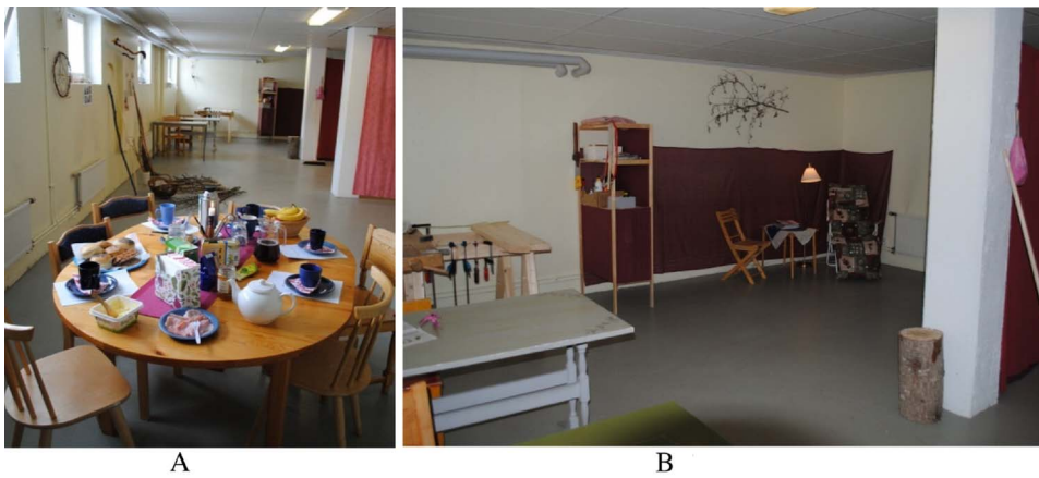
Fig. 2. A: view from the coffee-table into the room in the handicraft environment. B: the corner for relaxation. C: carving fresh twigs. D: hangers resulting from the carving.