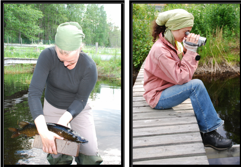
Fig. 4. Placing the pike dummy in the ponds, and detailed recording of duckling behaviour.

The impact of pike on breeding duck populations (Solman, 1945), and a documented lack of avoidance of such lakes by nesting pairs, is intriguing. It led to further questions about in situ responses of adults and ducklings. We wished to investigate whether ducklings avoid lakes with pike, either by recognizing their shape, or by using olfactory cues. To test this hypothesis I used a frozen pike in the water to assess the behaviour of ducklings. I also investigated their movements to see if they avoid the area of the pond where the frozen pike was placed. Additionally, I wanted to test the innate responses to other predators, such as birds and mammals. I used bird calls and a trapped mink to analyse predator response and avoidance behaviours. I also investigated the direct response to imminent threat from the air and from the water. A stuffed goshawk was strung to a wire and attack was simulated by sliding it in a downwards movement towards the ducklings in the pond. A simulated pike attack was also carried out with the frozen pike. The pike was either pushed using a pole or pulled with a fishing rod to break the surface near the ducklings.