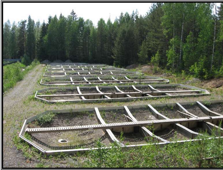
Fig. 1. Drained ponds at Evo research station.

Evo Game and Fisheries Research Station belongs to the Finnish Game and Fisheries Research Institute and I was kindly offered to use some of the fish ponds and equipment for my experiments. These ponds have been constructed for fish and crayfish experiments, and the water level can be manipulated by altering inflow and outflow from a river running past. These ponds were used in experiments of predator avoidance behaviour in ducklings.