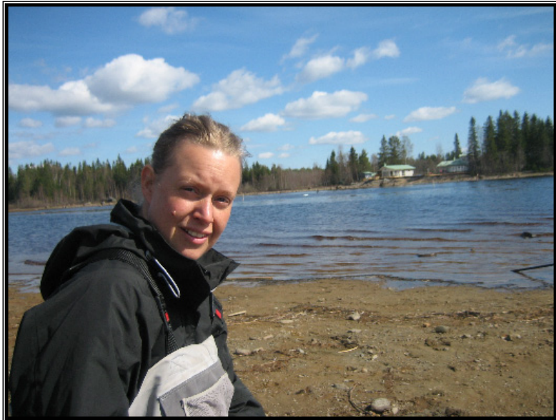
Fig 3. Catching pike in Västerbotten prior to lake introductions.

The data from the bird surveys of the descriptive study were later used as baseline information in a pike introduction study. Pike were added in natural densities to two of the previously fishless lakes, whereas the other nine remained as fishless controls. That way a before-after-control-impact study design could be used to investigate the impact of pike predation in a typical shallow boreal wetland.