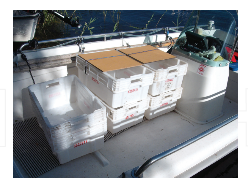
Figure 5. CrayShower on board transport application. This system uses lake surface water, thus not suitable during warmest summer days.