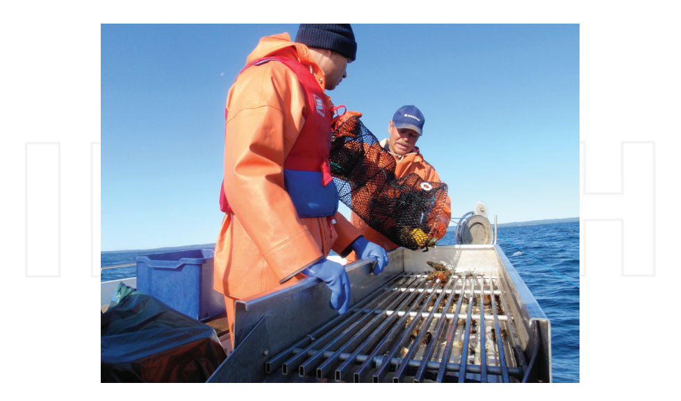
Figure 2. Sorting of crayfish catch on board by size. A system of a grid with expanding distances of metal bars allows crayfish to be sorted by size as they slide on the grids.

Crayfish catch can be sorted by size, by appearance, by sex and sometimes even by species [29]. Quite often, if the catch is sorted on board, only a rough sorting to potential commercial catch and those crayfish to be released is carried out. In Sweden, specific grid systems for automatic sorting of crayfish catch by size have been utilised ( Figure 2 ). The sorting is happening after a