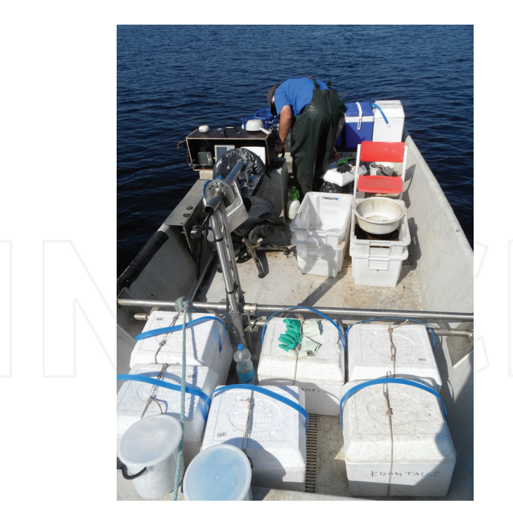
Figure 3. Crayfish transported on board in foam boxes with cooling and moisture provided.

Crayfish tend to go passive with lowering of the temperature. It is preferential to provide stable conditions during transport, and for this purpose, a simple environment within cooled foam container, i.e., esky or foam box for fish, has shown to be optimal [10, 23] and is commonly used both in Sweden and Finland ( Figure 3 ). The instant cooling of crayfish under conditions, which also provide immobilisation and moisture, has shown to decrease stress [16, 28] and minimise mortalities even during prolonged transport.