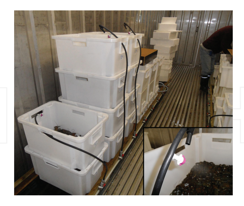
Figure 6. CrayShower with stacked plastic containers for holding of crayfish and a close-up of the water sprinkler system (small picture).

Crayfish can be held under these conditions for several months without significant losses in the number or quality of crayfish. Tasting tests indicated that crayfish held for 9 months in the CrayShower were of equal quality (test and texture of flesh) compared to those been held in tanks and given food for the same period. The survival among the CrayShower-held crayfish was significantly higher and stable throughout the holding period than tank-held crayfish. Thus, the CrayShower system, being slightly more expensive to build, would be more economical to utilise than the conventional holding in tanks. The benefits of the CrayShower would be less water utilised, higher survival of crayfish and decrease in workload.