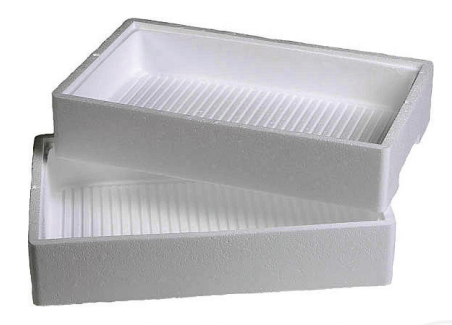
Figure 7. An example of the foam boxes suitable for the transport of crayfish on land. The corrugated bottom structure allows for maintaining moist conditions without crayfish being submerged.

Crayfish should be gently packed in specific foam boxes for the transport to the markets [23]. There should not be more than two layers of crayfish with moisture and cooling provided inside the foam box. Quite often, shallow foam boxes with less than 15 cm in height, which are routinely used in fish transport, are convenient as they can be stacked easily or can be equipped with lids ( Figure 7 ). No more than two layers of crayfish inside the box ensures that crayfish can be moving around, if needed, and the pressure from crayfish would not create circumstances which would suffocate those crayfish on the bottom. Cooling can be provided in the form of ice on the bottom of the foam boxes or cooling units [10], as long as it is ensured that crayfish would not be in direct contact with frozen solid items. It should be taken care of that the water level inside the foam box is low so that crayfish are not submerged and thus capable of gas exchange during transport. There is no need for ventilation holes in the foam box, as there is always enough oxygen in the air for crayfish and the content of metabolic gases created by gas exchange does not reach levels harmful for crayfish. The ventilation actually worsens the conditions during the transport, because it may cause elevation of the temperature due to loss of insulation and it may result in loss of moisture.