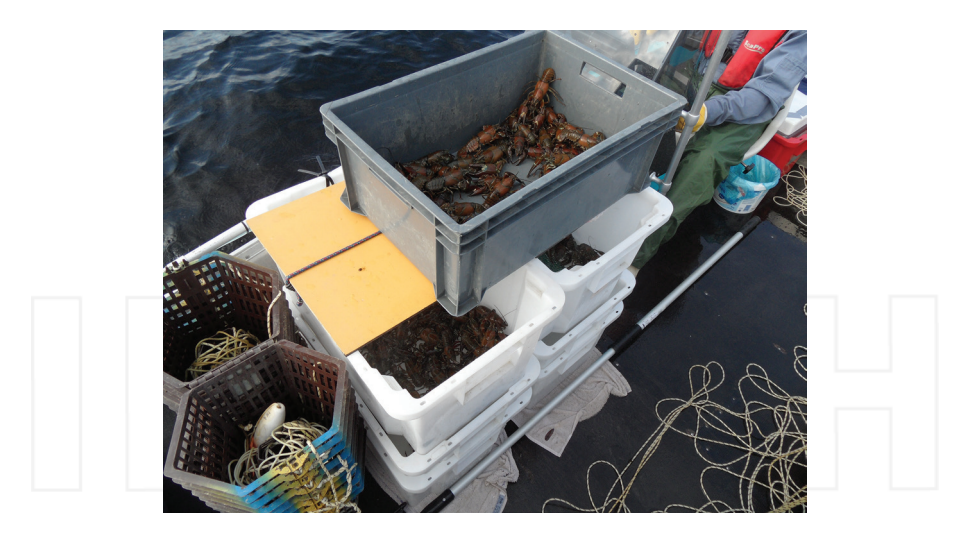
Figure 1. Sorting of crayfish catch on board according to commercial and side catch criteria. White crates with partial lids for the commercial catch and grey crate for temporary holding of the side catch.

Crayfish catch can be sorted by size, by appearance, by sex and sometimes even by species [29]. Quite often, if the catch is sorted on board, only a rough sorting to potential commercial catch and those crayfish to be released is carried out. In Sweden, specific grid systems for automatic sorting of crayfish catch by size have been utilised ( Figure 2 ). The sorting is happening after a