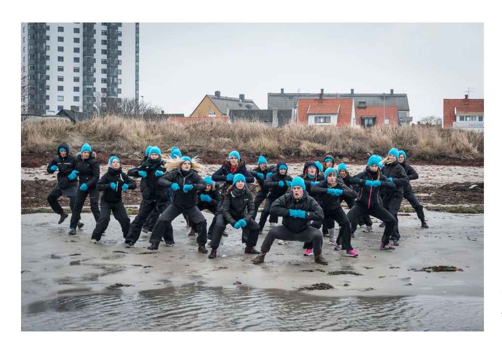
Figure 5: The 'haka' started the performance, challenging the sea.

The performance ended with an invitation to everybody to meet inside the library for a discussion about sea-level rise and the future of Höganäs (figure 8d). A large group followed the performance from the harbour to the library, among them some employees from the municipal authority and politicians. Many of these also followed the students into the library and participated in the discussion, where the students, the choreographer, a research colleague, a representative