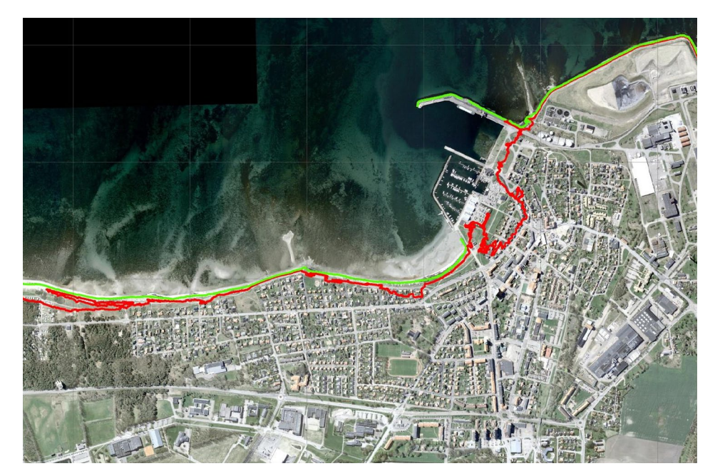
Figure 1: The red line on the map represents the idea about the future coastline in around 100 years, when the sea is at its highest. The line is static (in the same way as the actual coastline on the map) and does not communicate the dynamics of the coastal landscape. (Map: DHI for Höganäs municipality.)

storms, currents or even human behaviour; instead, topography and height above sea level tend to govern decisions about building sites or protection measures. The static map is less useful as a single tool for communication and could even be seen as negative, as it reinforces the static view and use of the coast in a world that, in reality, is changing. Threatened infrastructure or buildings might never be questioned or thought of as moveable, while preserves for nature and heritage might be regarded as protected geographically in their specific location, instead of as areas that can be maintained only by letting them move geographically in relation to the water line.