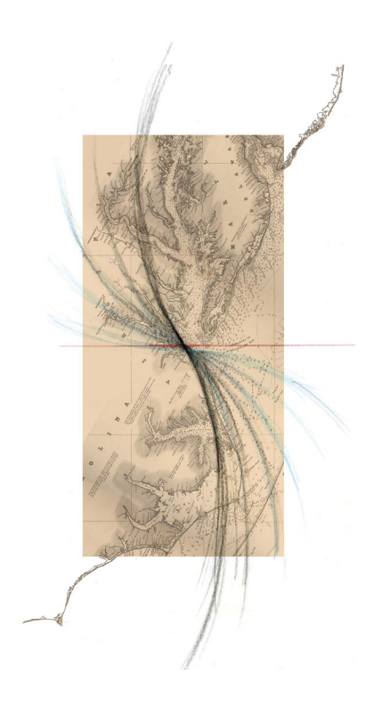
Figure 2: The conventional protective line of demarcation to the sea is turned 90 degrees in Mathur and da Cunha's proposal for Norfolk at Chesapeake Bay, USA, to form fingers of high ground' that can be used for safe retreat during floods. (Sketch: Anuradha Mathur and Dilip da Cunha.)

Storytelling of different kinds appears to be a powerful tool for communicating information about landscape and social change that is difficult to understand for different reasons – for example, it may be unknown, abstract or unwanted.