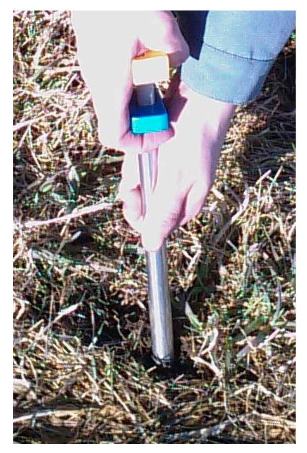
Fig. 1 Pasture soil sampling was performed with a cylindrical metal instrument, inserted in the ground to a depth of 3–4 cm.

The soil sampling was done every 5–10 steps while walking along a W-shaped route, and soil samples were collected by taking an equal sample from the upper ground layer (diameter \sim 2 cm) at a depth of \sim 3-4 cm using an instrument (Fig. 1). Fresh dung was avoided and the sample collection was subsequently repeated in an opposite W-shape, whereby the samplings were randomly distributed over the whole area. For each W-shape route, approximately 50 subsamples were merged into one pooled sample of 400–700 g.