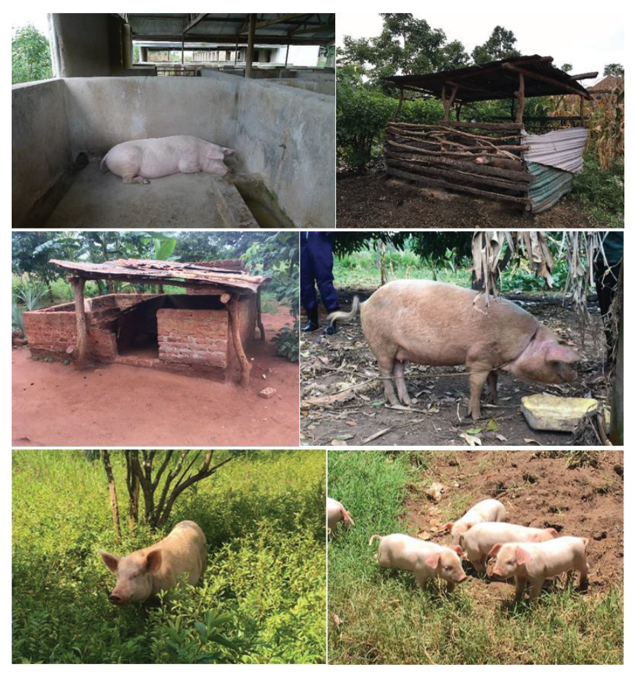
Figure 1. Different rearing conditions in Lira, Uganda.

weeks (Dione et al. , 2014b; Ouma et al. , 2014). On the contrary, a study from Kenya found that castration was mainly performed after the age of 4 weeks (Kagira et al. , 2010). Castration is most often performed by a hired person, and not by the farmers themselves (Dione et al. , 2014b). Teeth cutting is not a common practice (Dione et al. , 2014b; Biryomumaisho & Ogalo, 2007). Administration of iron is generally not routinely performed, instead some farmers let their pigs scavenge in order to ingest red soil as an iron booster (Dione et al. , 2014b). As previously stated, farmers themselves regard lack of knowledge on management practices as a limitation to the animal health (Dione et al. , 2014b).