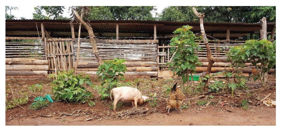
Figure 3. A stray pig and a chicken outside a confined herd.

Biosecurity was generally lacking (Fig. 3). While six farmers confined all their pigs, 16 herds mixed their pigs with others during service, and only two herds never had contact with foreign pigs. The use of quarantine for newly acquired pigs was uncommon. Some farmers claimed to use disinfectant boot baths, but these were either not used in practice or used without prior cleaning of the boots. Age segregation was observed in one herd only, and all in-all out was not practiced. On the other hand, the pig density for the confined pigs was generally low, as compared to e.g. Swedish legislation (Statens jordbruksverks föreskrifter och allmänna råd om grishållning inom lantbruket m.m., SJVFS 2019:20, Swedish Board of Agriculture, 2019), and the confinements were often reasonably clean from visible feces. However, the pens were seldom cleaned with water and detergents, and were rarely disinfected. In many cases such procedures were not practically possible, due to e.g. earth flooring or poor constructions, but it might also have been due to the lack of knowledge or money (Nantima et al. , 2016).