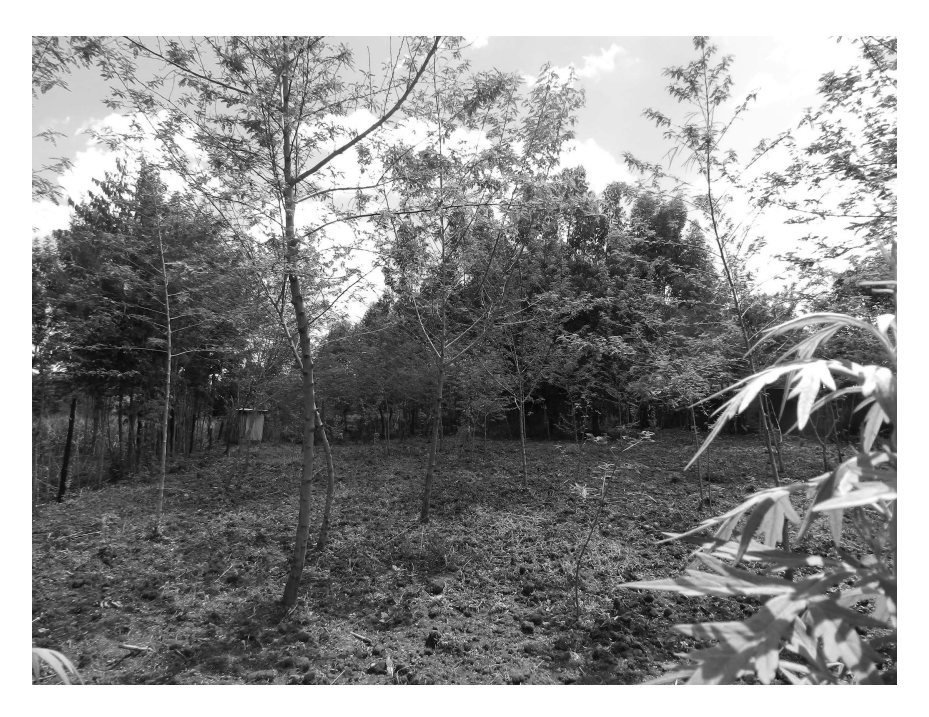
Figure 23.1 Sesbania planted as a relay crop in a maize field on a smallholder farm to improve soil fertility and provide firewood

Substantial amounts of firewood can be produced through planting trees in various niches (Kamanga et al., 1999; Sileshi et al., 2007; Figure 23.1). According