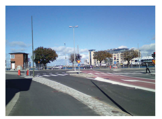
Figure 2. Example screen-shots from the Malmö tree database.

root intrusion and if there were no other trees within 15 m of the root intrusion. As a control, a second tree or bush of the same species and of similar age, growing under similar conditions, was selected to represent the control in the pair (Table 1). The control individual was always located at a distance from the point of the root intrusion and with the sampled tree located between it and the intrusion point, to ensure that the roots of the control had not reached the pipe.