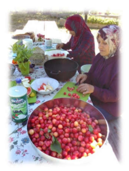
Figure 2. As a part of the program, participants prepare a meal from the crops harvested from the garden (published with the consent of the participants).

participants prepare a meal from the crops harvested from the garden (see Figure 2, published with the consent of the participants).