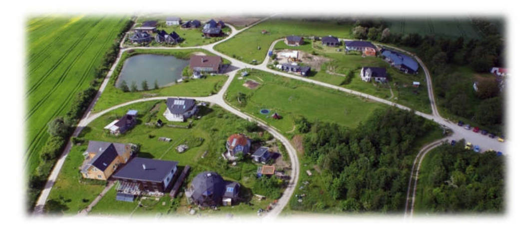
Figure 1. An aerial photo of Hallingelille ecovillage, showing the main housing areas and the surrounding outdoor environment of forest, lake, and agricultural fields.

Hallingelille is an ecovillage located in the middle of Zealand [34]. It is home to 80 residents ranging in age from 0 to 75 (approx. 50 adults and 30 children). Figure 1 gives an overwiev of the village.