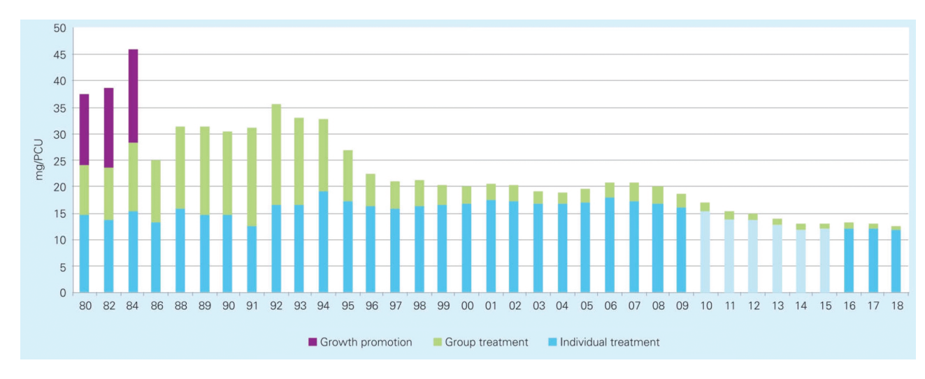
Figure 2. Sales of antibiotics for animals in Sweden expressed as mg per population correction unit (PCU) (Swedres-Svarm, 2018).