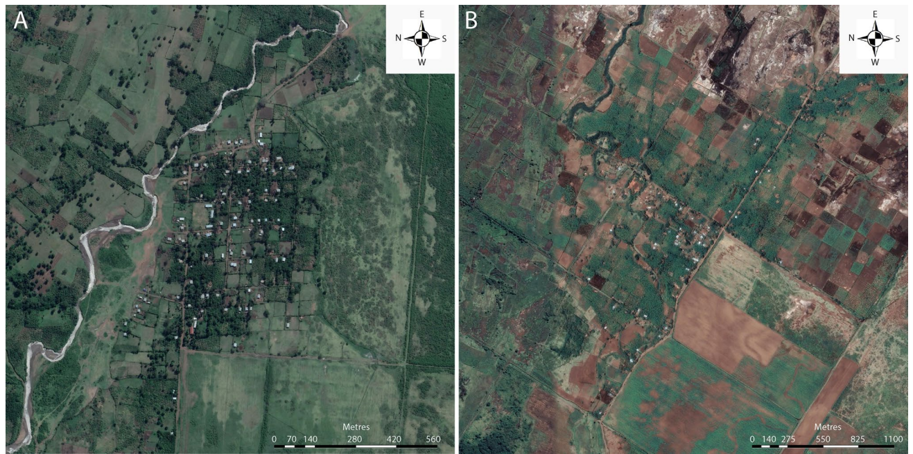
Figure 1. Aerial images of the two study villages, Abulo (A) and Magge (B). The two rural villages are situated within similar agricultural landscapes. Aerial images are taken at different times of the year, which is seen in the difference in crop cover in the two villages. The scale bars indicate distance (m). The aerial images were obtained using the open software Google Earth Pro (Version 7.3.3.7786).

that search outcomes in herbivorous insects are dependent on behavioural patterns within species, which can be broadly categorized into the resource concentration hypothesis 29 or the edge effect 30 . The resource concentration hypothesis postulates that searching individuals are likely to locate and remain in stands with a high host density, and the edge effect favours resources being more extensively used in sparse patches, and importantly more on the edge than in the centre of those patches. The edge is defined as the abrupt transition between habitats differing in quality, affecting the performance of individuals 31 . A patch can be defined as a relatively homogenous nonlinear area that differs from its surroundings 32 and for mosquitoes, we may regard the assembly of blood hosts in a community, either at the household or village level, as a patch, and the homes placed on the outskirts of a community as on the edge of that patch.