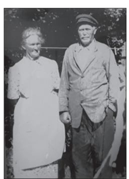
Pictures 3, 4 and 5. Family pictures of FIS20 from the old days. His ancestors. Men and women involved in fishing activities in Blekinge Archipelago in the Baltic Sea

Excerpt 2 is a good example of telling a particular history to an audience and herself' as a way of reaffirming and reconstructing 'the self' by FAR1. She considers herself as a pioneer in supplying eco-milk in the region for 20 years. Excerpt 2 illustrates FAR1's critical view of the current discussion on meat consumption and production from her professional perspective: