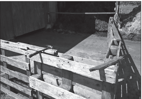
Pictures 1 and 2. Artisanal electric fences in place, young heifers will learn how fences work