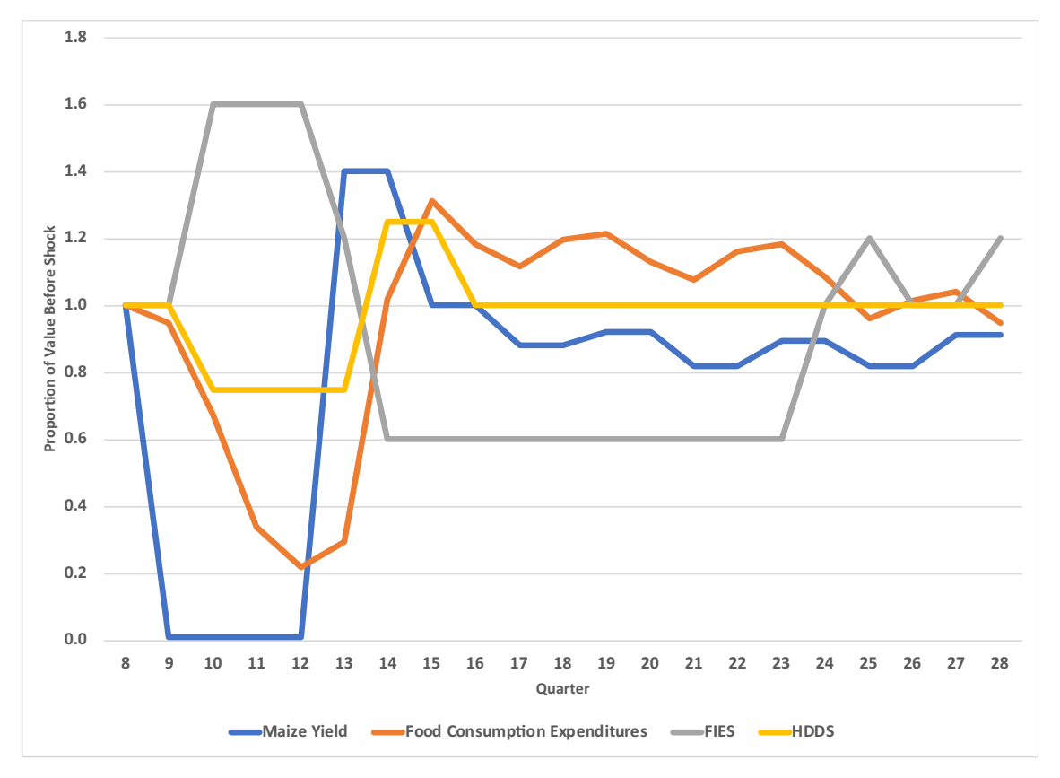
Fig. 1. Simulated Impacts of a Maize Yield Shock on Three Food Access Indicators in the CLASSES Model. Note: A higher FIES score implies decreased food security.

5% confidence bound). It can be thought of as the maximum disturbance before the system "breaks". The more elastic the system, the larger the disturbance it can absorb without shifting into an alternate regime. Application of this stability analysis requires specification of which indicators will be assessed and the range in the magnitude and duration of shocks that will be evaluated. A set of stochastic simulations with different values for shock magnitude and the duration is assessed to determine hardness and elasticity metrics.