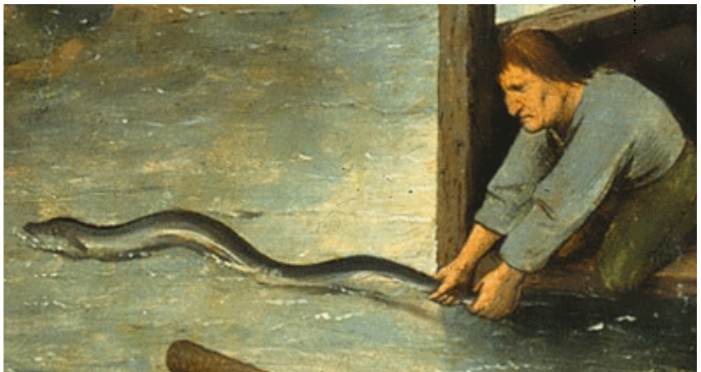
"We've got the eel by its tail again – Dutch proverb indicating "to achieve the impossible".