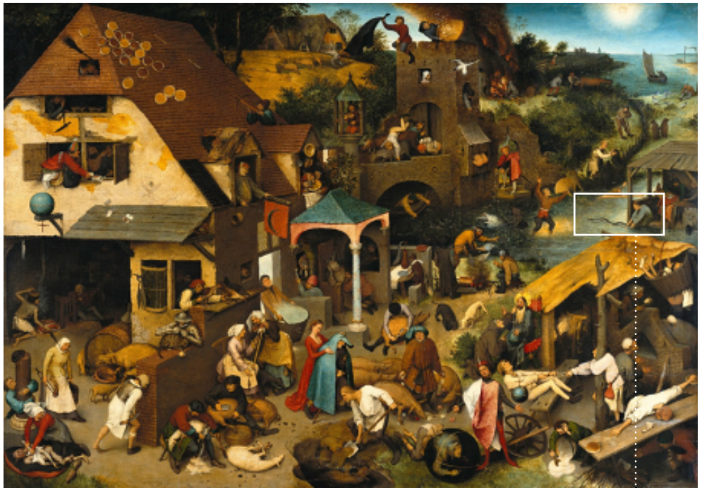
The painting "Proverbs" (1559) by Pieter Brueghel the elder (c.1525 – 1569), and a detail.