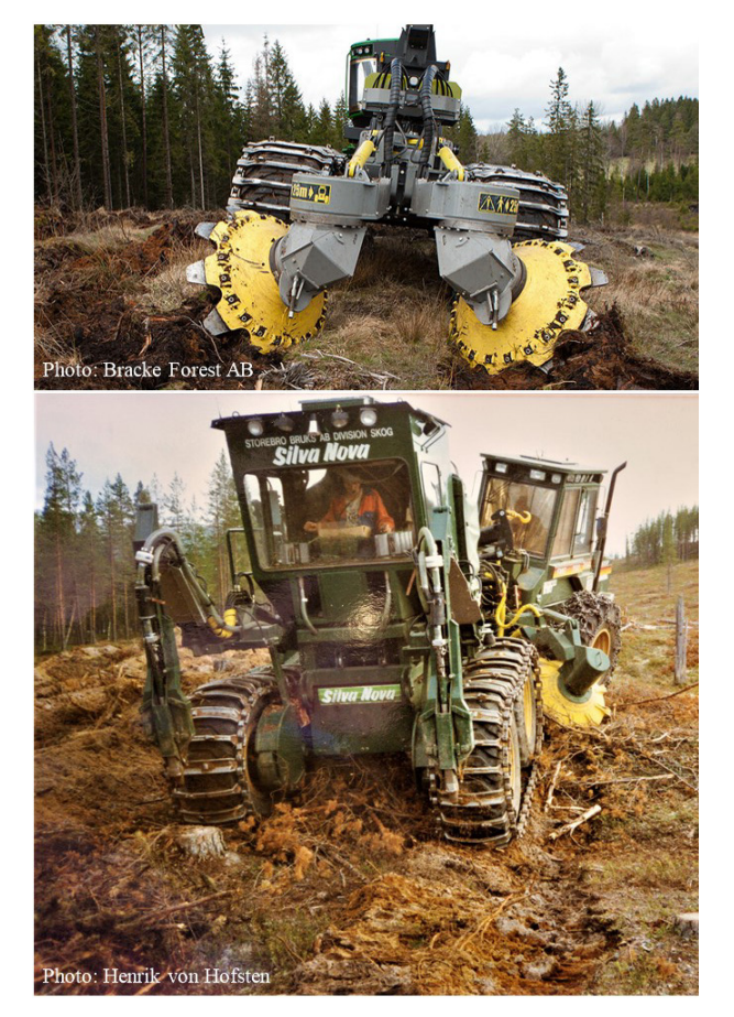
Figure 1. Site preparation with a 2-row disc trencher (top), and with the Midas disc trencher on the Silva Nova planting machine of the 1990s (bottom)

Nova (Ramantswana et al. 2020). However, in our view, certain improvements like planting spot detection and autonomous route finding are required to make continuously advancing tree planting machines (such as PlantmaX) more competitive.