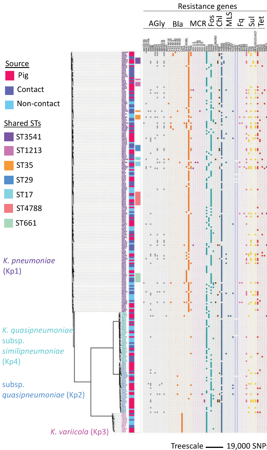
Figure 1. Phylogeny of core gene SNPs (372059 SNPs) from 253 K. pneumoniae isolates and distribution of their antibiotic resistance genes.

with bla CTX-M-55 and mcr-3.19 . This evidence is worrisome, since the spread of mcr or ESBL genes could be facilitated and transmitted to other pathogens and could spread to other hosts or environments. 17