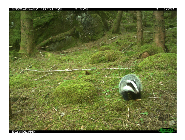
FIGURE 1 Camera trap image of a regularly colored badger from the study area, showing the distinct gray-brown body, dark legs, and black and white facial marks

The Eurasian badger normally has a distinct coat coloration with a gray-brown body, dark legs, and black and white marks on the head (Figure 1; Kruuk, 1989; Roper, 2010). Albino, leucistic, melanistic, and erythristic Eurasian badgers have been described before (Roper, 2010) and seem to occasionally be sighted in the UK (Badger Trust, 2021). However, to date these observations have not been recorded in an accessible format, such as in the scientific literature, making it difficult to assess the frequency of occurrence and study the causes and consequences of coat color anomalies in Eurasian