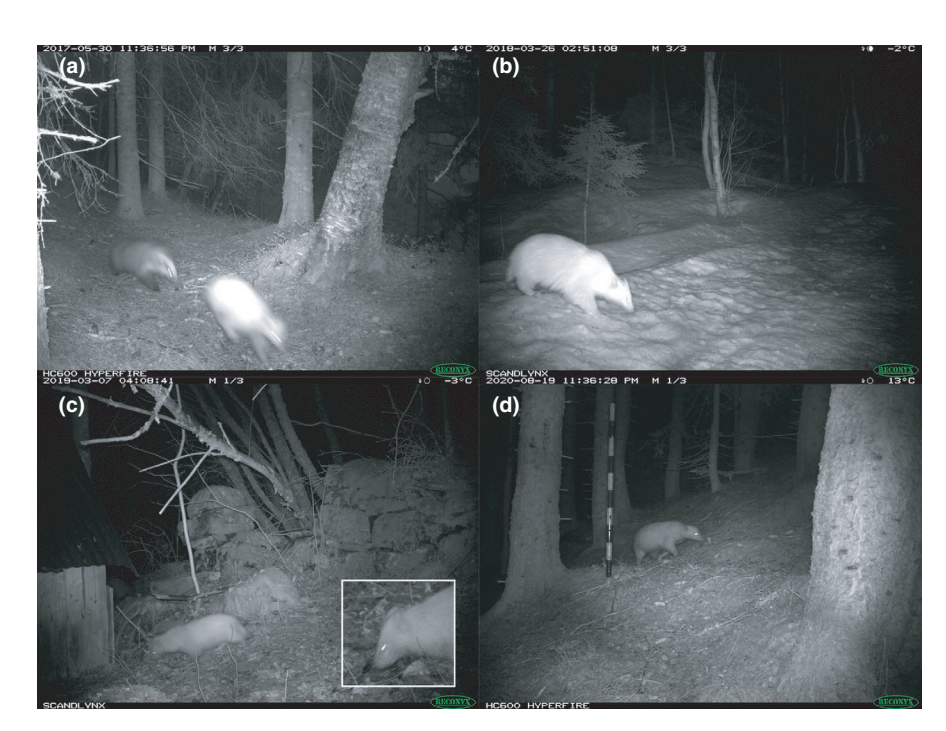
FIGURE 3 Records of leucistic Eurasian badgers ( Meles meles ) in central Norway. (a) First record of a leucistic badger in Norway. A regularly colored badger (left) chases the leucistic badger (right) showing the clear difference in coloration. (b) Second record of a leucistic badger at a different location. (c) Third record of a leucistic badger at a third location, inset: close-up of the head showing the dark nose. (d) Last record of a leucistic badger at the same location as A but from a different camera angle

and HA2 were 70 km apart, we conclude that we have observed at least two individuals.