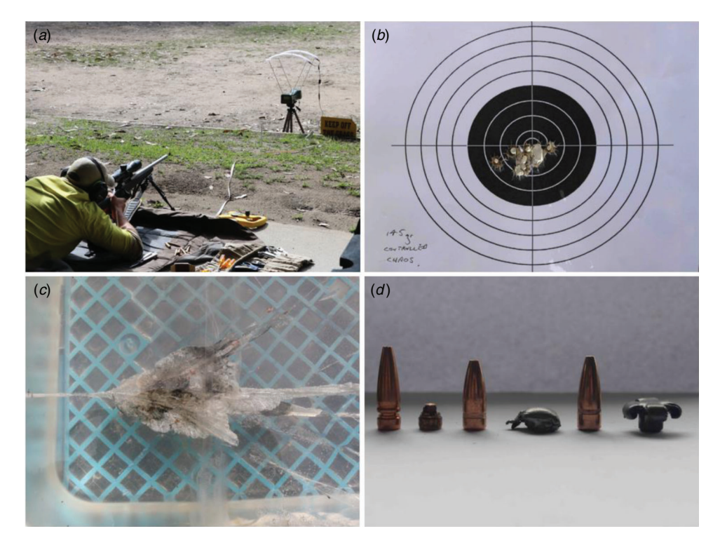
Fig. 1. Shooting range methods used for testing new ballistic technology before beginning animal-based trials, eastern Australia, 2018. ( a ) Use of a chronograph to measure projectile velocity, ( b ) assessment of precision through shot grouping, ( c ) use of tissue simulant gel to assess terminal ballistics patterns, and ( d ) examination of bullet weight retention and deformation.