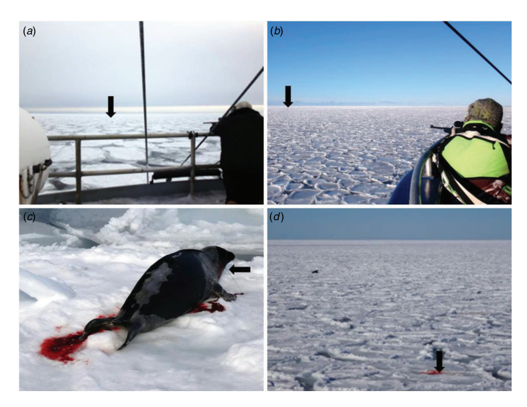
Fig. 3. Boat-based shooting practices used to harvest adult harp seals ( Pagophilus groenlandicus ) in pack ice in Atlantic Canada, 2016. (a, b) Arrows indicate the position of targeted seals and extended shooting distances, (c) a conscious seal having been shot in the neck (arrow) and remaining conscious and mobile and (d) an arrow indicates the typical blood trail evidence of a struck-and-lost seal.