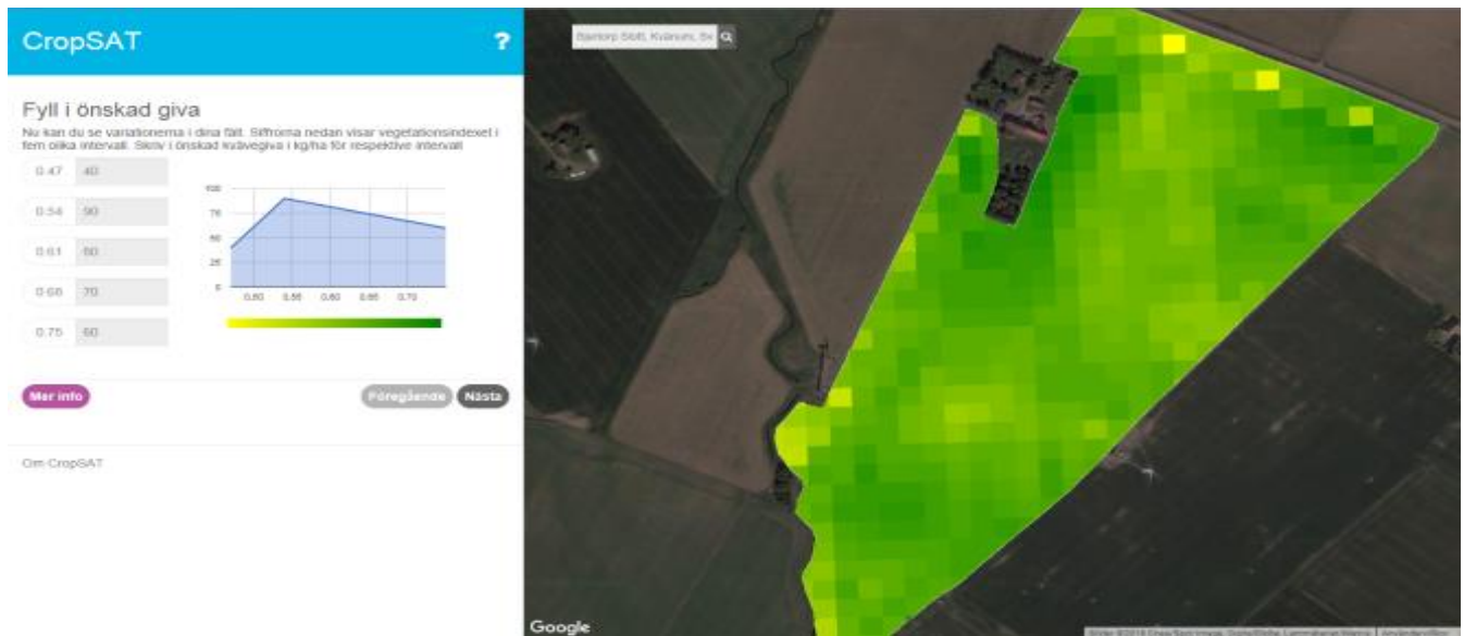
Figure 1a. Vegetation index (VI) displayed on Google Maps, where the user must enter five levels of nitrogen fertilisation compared with the coloured scale.

thematically (Patton, 2004). It should be noted that in Sweden farmers pay for most of the extension work to improve agricultural production issues. In this paper, the participating advisors were categorised as independent according to Kuehne's and Llewellyn's (2017) taxonomy because they were either employed by the Rural Economy and Agricultural Societies in different regions or by a private firm, but were not resellers. According to Klerkx's et al. (2017) typology they would be considered part of an elitist fraction of the national extension system.