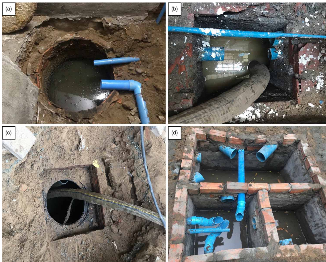
Figure 1 | Typical (a) circular and (b) rectangular cesspits and (c) imported plastic and (d) rectangular brick septic tanks used by households in Phnom Penh. Please refer to the online version of this paper to see this figure in colour: http://dx.doi.org/10.2166/washdev.2021.193 .

consists of two or three chambers, with the first chamber receiving everything from the toilet. The supernatant then flows to the next chamber. The supernatant from the last chamber can flow freely to the urban drainage network if it is located within the drainage coverage area. Septic tanks made from plastic are normally imported from Thailand or China. Circular or rectangular cesspits, another onsite sanitation technology, are also commonly used in the city. The circular type is made by assembling two to six pre-cast concrete rings. The rectangular system is similar to a septic tank, but has only one chamber (Figure 1). Residents in Phnom Penh commonly use both auto-flush and pour-flush toilets. Since piped water distribution has almost a full coverage, householders use water for anal cleansing/washing, whereas tissue paper is only used by a small proportion of the population.