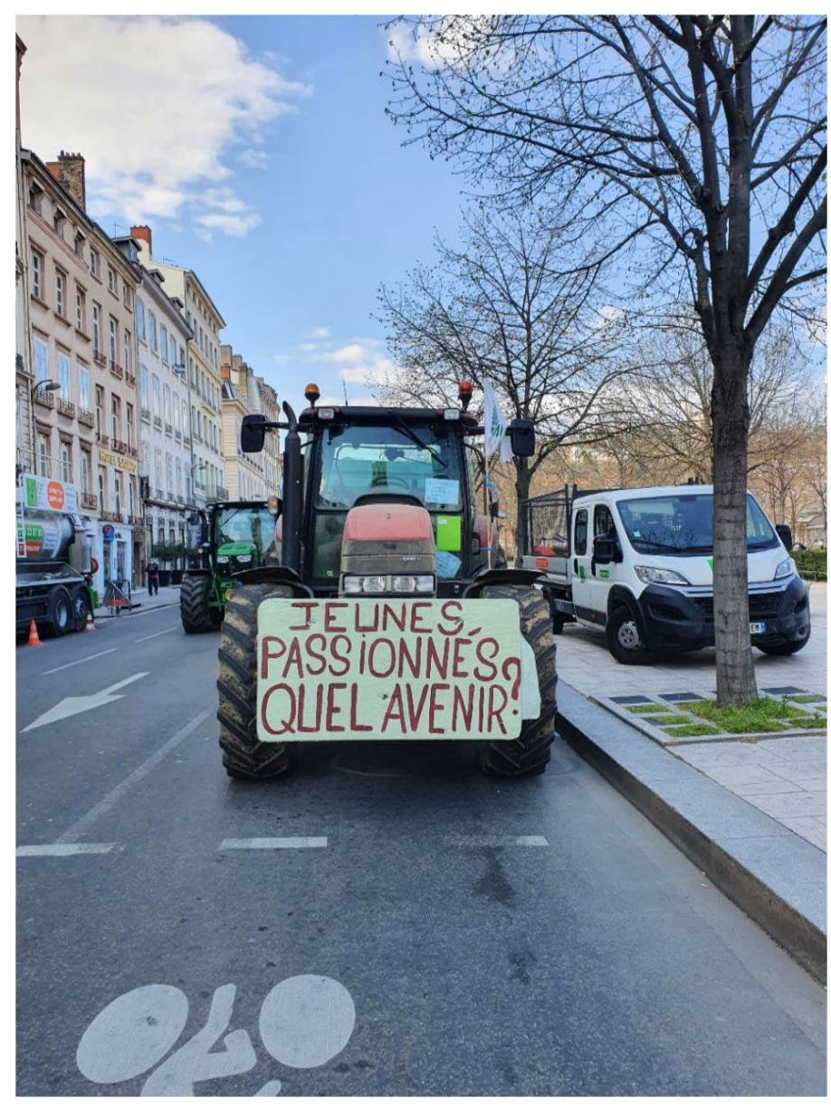
Farmers protest against the CAP in May 2020, Lyon, France © Sophie Thoyer.

Second, experiments offer the possibility to isolate the effect of a policy from other factors. By using the control group principle and assigning participants randomly to groups, experiments allow for a better causal inference than observational data studies. Responses to a set of alternative policy designs can be tested, and differences can be attributed to specific elements of a policy.