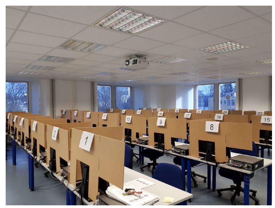
Setting up a lab for experiments with farmers during a workshop at the University of Giessen, Germany.

which encourage the participation of all. This type of experiment has been repeated in other contexts with mixed conclusions, showing that context matters and that solutions must also be tested locally. Another approach could be to organise an RCT, comparing participation rates in randomly selected regions, some offering an AES with a conditional bonus, and others not. The flexibility brought by the new CAP delivery model could allow this type of experimental policy implementation.