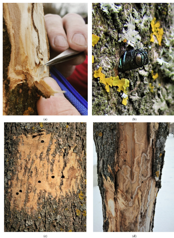
Figure 2. The emerald ash borer, Agrilus planipennis on ash trees in Saint Petersburg. (a) A larva being extracted from under the bark of Fraxinus pennsylvanica ; (b) an adult emerging through an exit hole; (c) exit holes in the bark of F. pennsylvanica ; (d) old galleries of the beetle on the dry-sided stem of F. pennsylvanica .

During the investigations, the lower part of the tree stems was visually inspected for incidence of bark loosening and cracks and the presence of characteristic exit holes of adult beetles and galleries of their larvae (Figure 2). The upper part of a stem and thick branches were inspected using Zeiss TERRA ED 8 × 32 binoculars (Oberkochen, Germany). Each tree where the attack of EAB was detected was felled and examined in detail. We followed routine practices of the Saint Petersburg City Administration for the removal of ash trees with various types of damage that represent a potential threat to the public and property. The number of trees examined, types of plantations, and GPS coordinates of localities are given in Table 1.