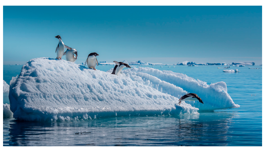
To have any chance of retaining the globe's biodiversity, nations must implement better, more robust biodiversity metrics into decision-making processes and policy.

be held to the same standards, rigor, and accuracy as any other nationally reported data, such as those on human population size, age structure, economic growth, and agricultural or industrial production. Measures of the state of biodiversity should thus be published as part of national statistics and mandated by legislation to ensure delivery. In March 2021, the 52nd United Nations Statistical Commission introduced the notion of biodiversity accounting in economic and financial decision-making, a move that represents an important step in changing international attitudes toward enhancing biodiversity policies. As researchers continue to gather knowledge on the structure, mechanisms, and determinants of biodi-