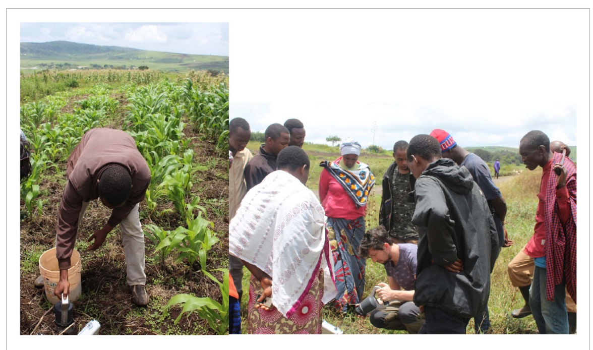
Figure 2. Community soil scanning.

Once the trial programme and sample locations had been designed and agreed with the community, the research team was guided around the village by the Village Officer. The sample locations were visited on foot and scan measurements were made by farmers, supported by the research team (figure 2). In addition, the team walked most of the trails in the area, so that farmers who were out working on their land could also be approached and asked if they would like to participate, enabling the inclusion of those who had not participated in the original workshop. Farmers chose the scanning locations on the farms themselves which was, depending on the size of their farms, mostly done in two or three areas of differing productivity, either in the same, or in different fields.