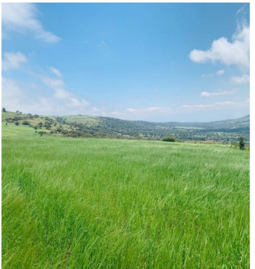
Figure 5. Use of farmyard manure and intercropping (beans and maize rotated with barley after every two seasons).

fertilizers, but after scanning I [...] use farmyard manure and intercropping between maize and beans to increase soil nitrogen and agriculture productivity. Now I am getting 7–9 bags of maize in the same piece of land. However, for barley, this is my first season to rotate farms with maize and beans and by the look of it – I will get high produce.