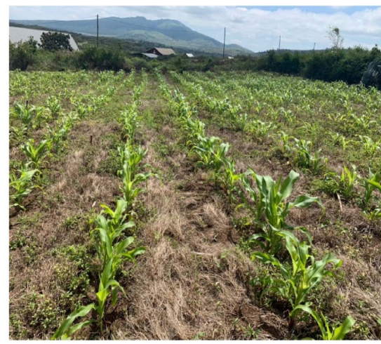
Figure 4. Changes in practice (mulching and crop rotation with maize and beans) resulting from scanner soil quality data linked to available technical advice.