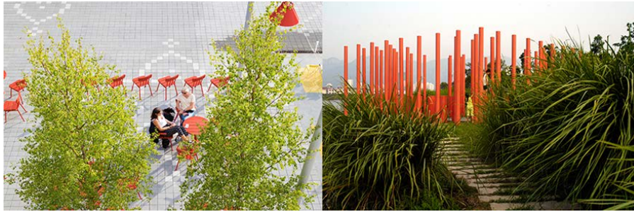
Figure 1. Left: Intense yellow and orange street furniture in a public square in Sweden designed by Karavan landskapsarkitekter, 2016. Right: Contemporary landscape architecture in Yongningjiang river park, China, designed by Kongjian Yu and Turenscape, 2004. (The photos are used with permission)