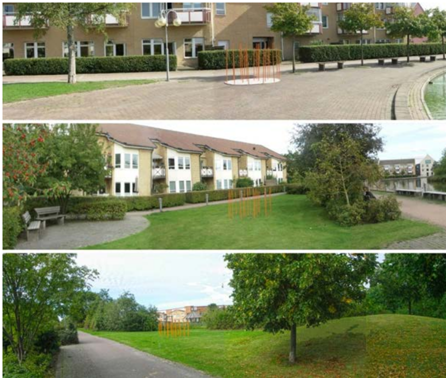
Figure 3. Photomontage (60°) showing the perceived landscape from the fixed locations (see Figure 2). From the top to the bottom: Plaza character (A), Pocket character (B) and Naturalistic character (C) with the presence of the orange urban artefact.

'Rigets have' in Copenhagen, Denmark (LAND+, 2008) and the Yongningjiang river park, China (Turenscape, 2004) with orange contemporary landscape architecture (Figure 1, right) as well as intense orange street furniture forming a focal point (Figure 1, left) in a public square in Bollnäs, Sweden (Karavan landskapsarkitekter, 2016). The orange hue was also chosen for its capacity to influence levels of arousal (Hanada, 2018; Costa et al., 2018; Al-Ayash et al., 2015) and its ability to enhance activity in the human body (Clark & Costall, 2008). Figure 3 shows the orange urban artefact incorporated in area A (plaza character), area B (pocket character) and in area C (naturalistic character) in Strandparken, Sweden.