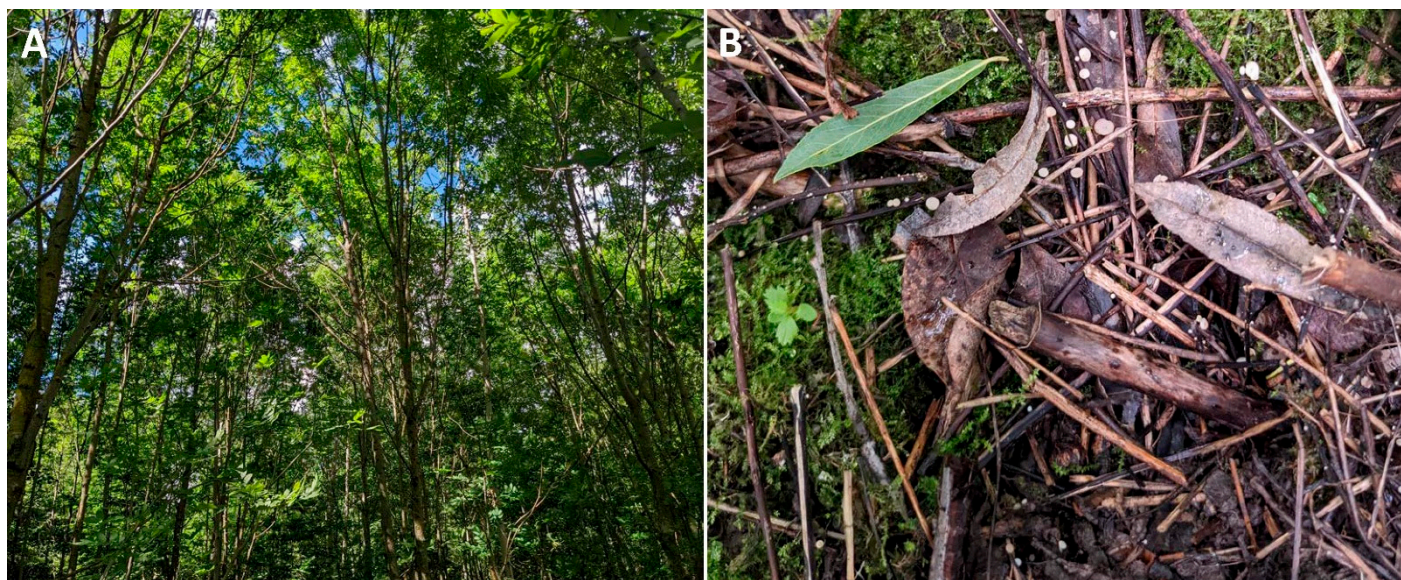
Figure 1. (A) Naturally re-emerged Fraxinus excelsior stand (site U2); (B) Hymenoscyphus fraxineus fruiting bodies on ash petioles at the U2 site.

* F— Fraxinus excelsior , P— Populus tremula , Q— Quercus robur , B— Betula pendula , U— Ulmus sp. , S— Picea abies , ** S—self-regenerated, P—progeny trial.