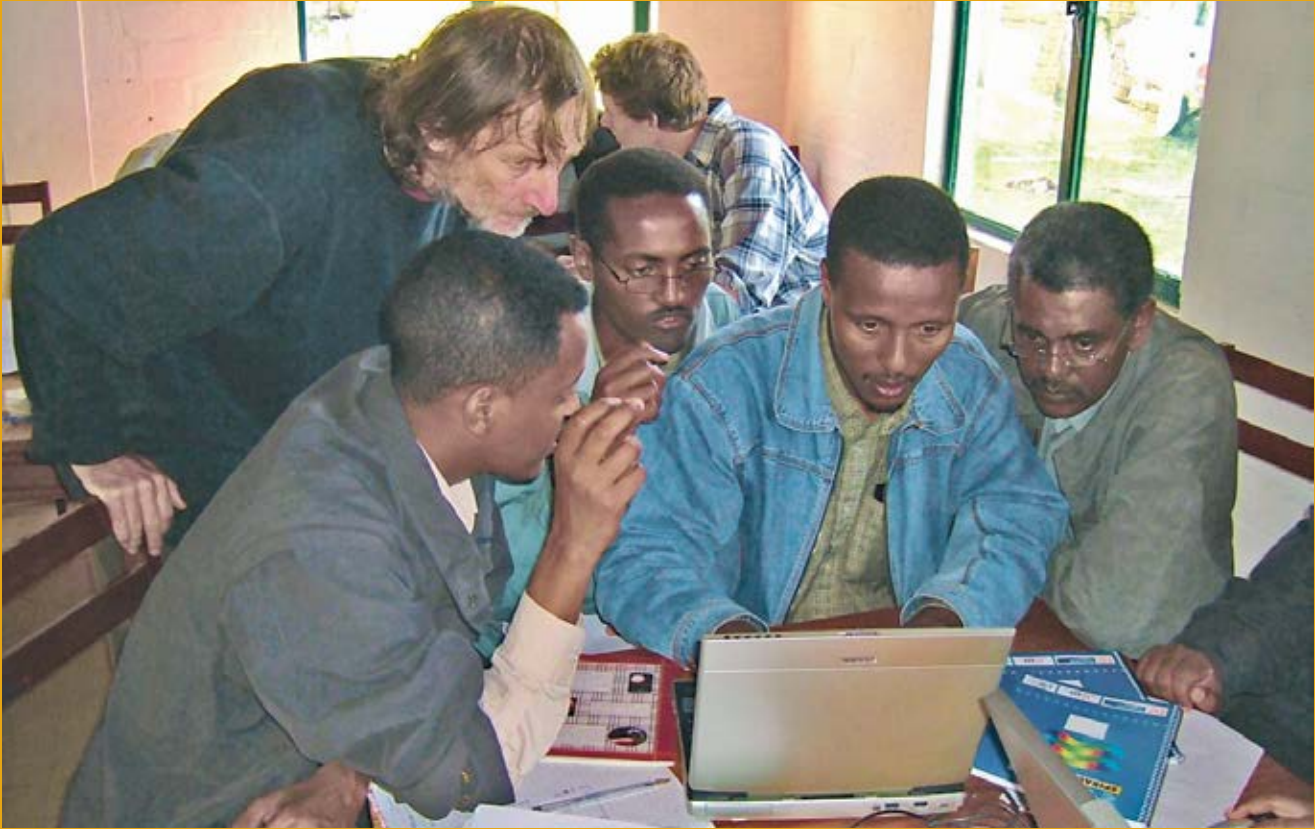
A field course at Wondo Genet College of Forestry and Natural Resources, Ethiopia, in the 2000's.