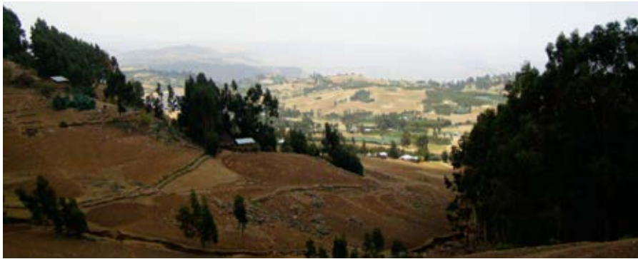
Not only deforestation and soil erosion, but also increased tree planting are seen in many parts of Ethiopia.

creased forward-looking. Improved publication rates by the faculty staff indicate stronger links to the global research community. At the same time, Sida's earlier investments in infrastructure and teaching capacity-building have been well utilized. There is, however, lack of maintenance of technical investments and laboratories. The political pressure towards "mass education" has led to a lack of resources and a worry for decreasing quality in education. PhD studies at Wondo Genet, including supervision and dissertation work, are also under risk from a decrease of resources. The efforts to attract investors and donors along with other universities in this field continue.