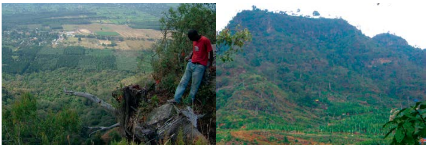
The densely populated agricultural landscape around Wondo Genet Campus, and its plantations, reflects common landscape trends in Ethiopia. Formerly forest-covered hills have been deforested as a consequence of expanding agriculture and firewood cutting, while cash crops have replaced subsistence farming.

Academic education in forestry emerged as an initiative of developmental aid, but it has since been integrated into the Ethiopian education system and thereby influenced by an expanding education policy. There has been a strategic investment in development of new curricula, since the old ones were not considered to be able to fill today's requirements. During 1991–2008 the number of universities in the country has increased from 2 to 22. The annual intake to universities and colleges in the year 2010/11 was 460 000 students (95% of those were at BSc level with some 26% females). The attraction of forestry education has, however, decreased in favour of more urban related educations. The number of first-hand applicants in forestry is presently less than 50% of the