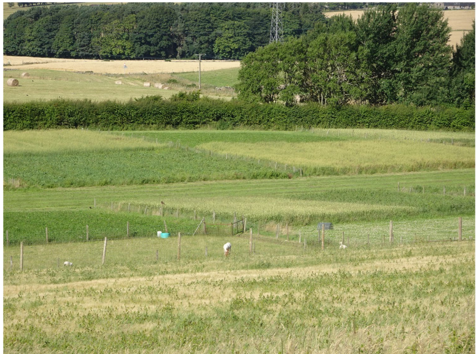
Fig. 1 Tulloch is a Scottish LTE established in 1991 with a 6-year crop rotation. In the stocked system, crops are partly grazed by sheep and receive farm-yard manure.

Incorporating perennial leys and grain legumes into cropping systems increases the yield of subsequent crops under most conditions compared to systems without legumes and perennial crops (Angus et al. 2015; Preissel et al. 2015; St-Martin et al. 2017). This is due to a positive pre-crop effect (residual and break crop effect) that enhances main crop yields by 20% on a global average (Zhao et al. 2022). Cover crops can significantly reduce nutrient leaching and also affect the yield of subsequent crops (Hauggaard-Nielsen et al. 2012; Plaza-Bonilla et al. 2016). While the effect of these diversification strategies (incorporating leys with different lengths, grain legumes, cover crops, and crop sequences) on yield has been observed in separate analyses, the effect of these strategies on yield stability, environmental adaptability, and the probability of diversified systems to outperform less diverse systems has not been investigated.